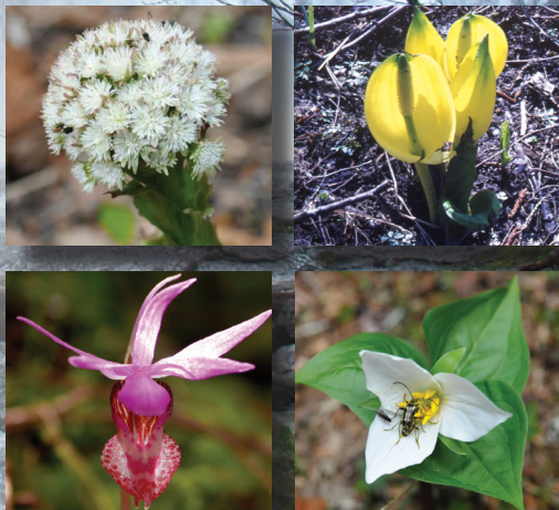
Lowland flowers, clockwise from upper left: coltsfoot, skunk cabbage, trillium, calypso orchid (fairy slipper)

What springtime treasures does the mountain have waiting for you to discover?