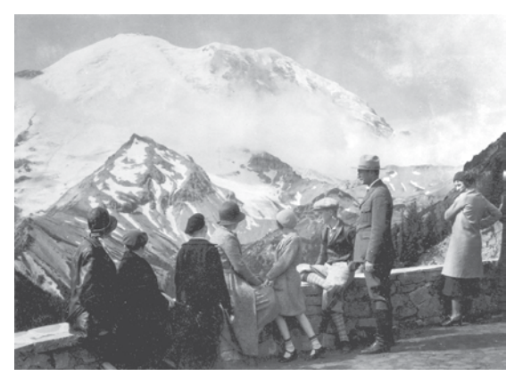
1930s Sunrise naturalist program.