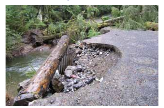
The November 2006 flood caused extensive damage to the Carbon River Road.

In November 2006, 18 inches of rain fell on Mount Rainier in 36 hours. Many park roads were flooded, including the Carbon River Road which was severely damaged and completely washed out in some areas. Due to the history of repeated flood damage to this 5-mile road, the park long range plan states it will be closed after the next major washout.