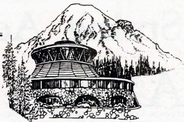
Jackson Visitor Center