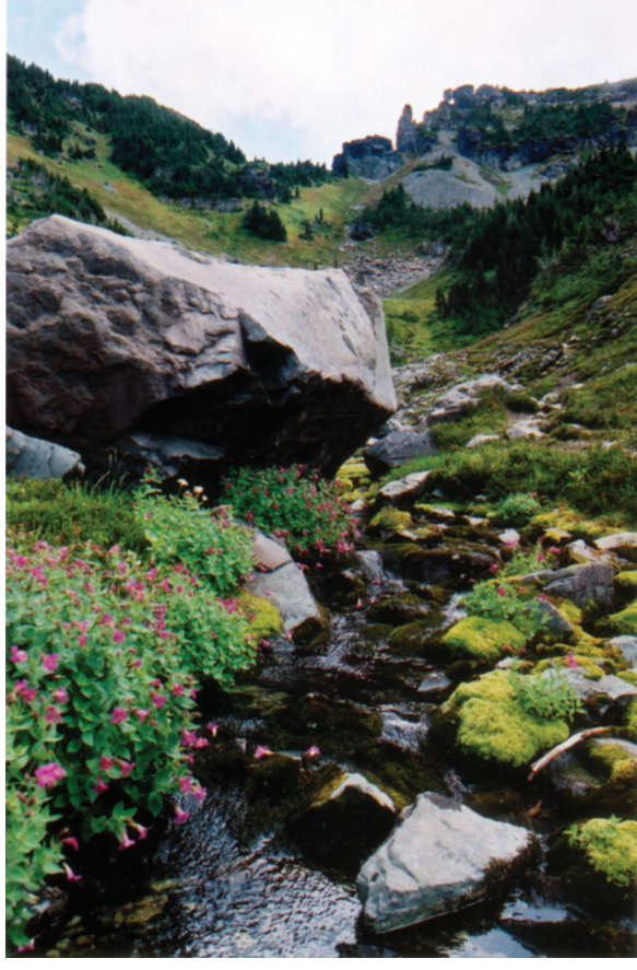
Knapsack Pass Trail, September 2002

The more time you spend in an area with geologic hazards, the greater the chance that you could be involved in an emergency event. While most people consider the danger to be relatively low, you must decide if you will assume the risk of visiting these potentially dangerous locations. If you are near a river and notice a rapid rise in water level, feel a prolonged shaking of the ground, and/or hear a roaring sound coming from upvalley – often described as the sound made by a fast-moving freight train – move quickly to higher ground! A location 160 feet or more above river level should be safe. Detailed information is available at park visitor centers or from scientists at the U.S.G.S. Cascades Volcano Observatory, 1300 SE Cardinal Court, Building 10, Suite 100, Vancouver, WA 98661, or visit the U.S.G.S. Cascade Volcanoes website: vulcan.wr.usgs.gov.