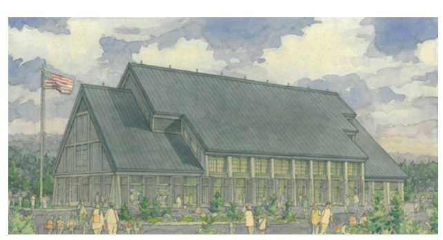
Artistic rendering of the new Paradise Visitor Center.

There is still one task to be accomplished before the project is complete: demolition of the old visitor center. In the spring of 2009 it will be removed. The area will become additional parking or be replanted with native vegetation. Some long-term visitors are sorry to see the original Henry M. Jackson Memorial Visitor Center go. They may be nostalgic for a place that figured in their family's experiences, or feel affection for the building's quirky charm. We hope the new visitor center—with its beauty, sustainability, and state of the art exhibits—will develop its own loyal following of people whose visit to Paradise was enhanced by its presence