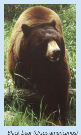
Black bear attacks are

Hike in a group rather than alone because groups generate more noise and have more defensive capabilities. Keep children close and in view at all times. Avoid running as it may stimulate the animal's natural instinct to chase. Pets should never be left unattended anywhere in the park or taken on any trail.