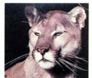
Mountain lion ( Felis concolor )