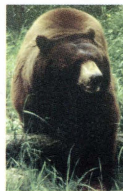
Black bear ( Ursus americanus )

The beauty and wonder of Mount Rainier National Park doesn't just come from the scenic grandeur of a single, towering mountain. The presence of wild creatures remains an essential part of the experience of wilderness. Being in the home of large creatures like black bear and mountain lion (cougar) can make Mount Rainier an exciting – and sometimes scary – place to visit. Though you are not likely to see them, if you do meet one of these larger mammals, learning more about them serves as your best defense – and theirs!