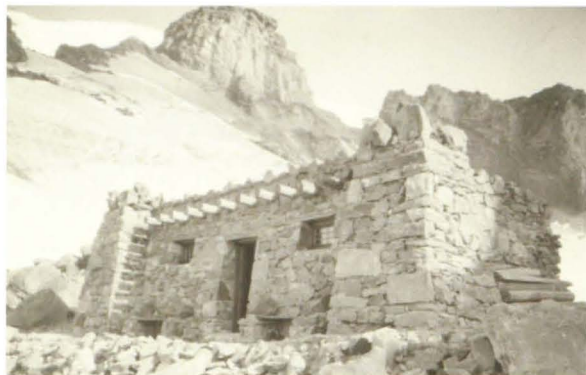
After rehabilitation this year, the Camp Muir Public Shelter will more closely resemble its original form, shown here c. 1929.

WHETHER YOU ARE LOOKING FOR WILDERNESS SOLITUDE OR HISTORICAL architecture, spectacular drives or challenging hikes, Mount Rainier National Park has something for you. This issue includes information that will help you plan your activities and have a safe and enjoyable visit.