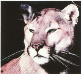
Mountain lion (Felis concolor)