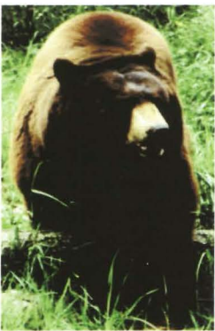
Black bear (Ursus americanus)

The beauty and wonder of Mount Rainier National Park doesn't just come from the scenic grandeur of a single, towering mountain. The presence of wild creatures remains an essential part of the experience of wilderness. Being in the home of large creatures like black bear and mountain lion (cougar) can make Mount Rainier an exciting – and sometimes scary – place to visit. Though you are not likely to see them, if you do meet one of these larger mammals, learning more about them serves as your best defense – and theirs!