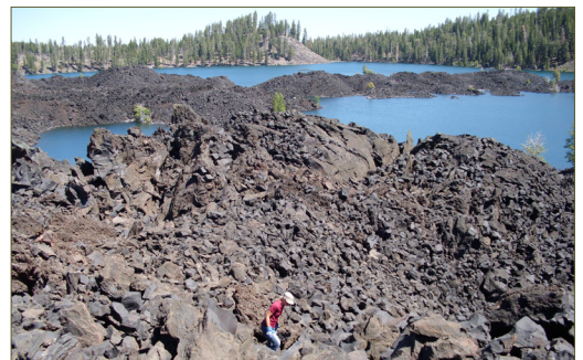
Above: Technician setting a monitoring plot at Lava Beds National Monument