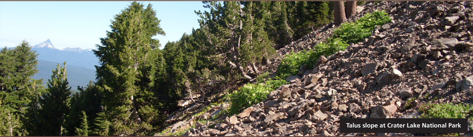
Talus slope at Crater Lake National Park

Crater Lake National Park, Craters of the Moon National Monument and Preserve, Lassen Volcanic National Park and Lava Beds National Monument