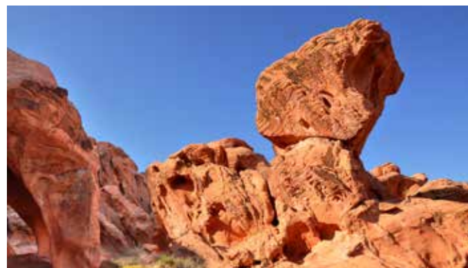
Rock formations at Redstone walking trail