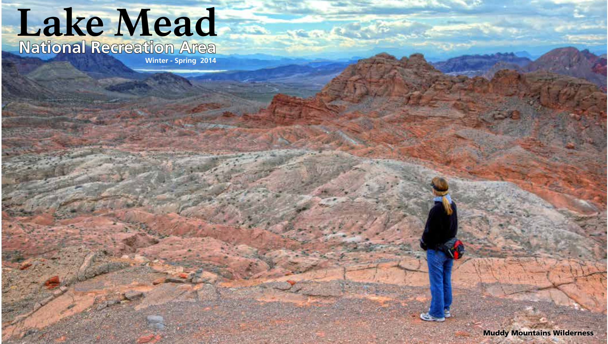
Muddy Mountains Wilderness