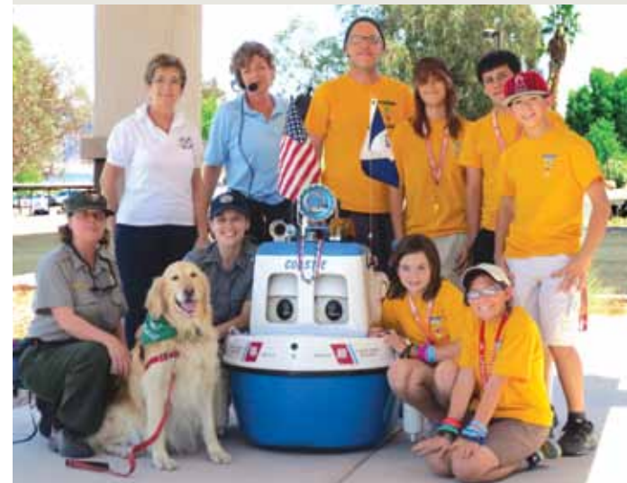
Representatives of 2013-2014 "Water Safety Education" partners gather around "Coastie" the talking robotic water safety mascot.

Quagga mussels are non-native freshwater mollusks that were found at Lake Mead NRA in 2007. They migrated in the 1980s from the Caspian Sea over to Lake Michigan, most likely attached to ship hulls. Once they infested the Great Lakes it was only time before the mussels traveled west. Quagga mussels destroy fisheries, pollute recreation areas, damage your boat and equipment, and cost millions of dollars to control and contain.