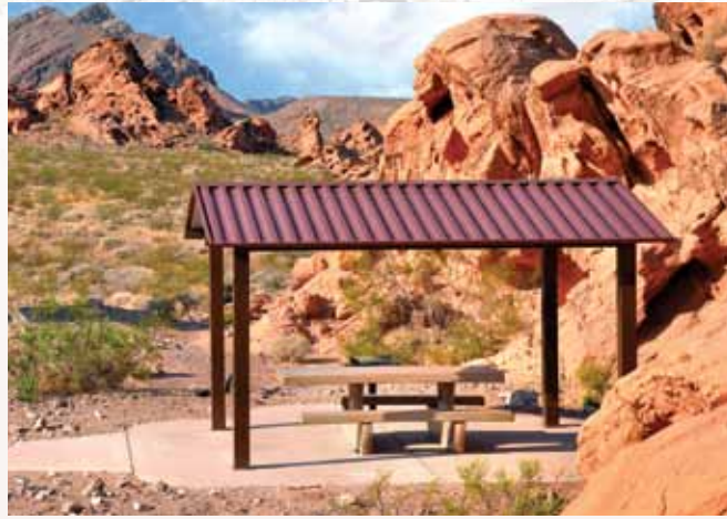
Picnic area at Redstone