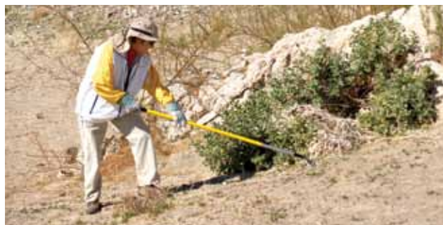
Adopt-A-Program volunteer maintains his "favorite spot"

Lake Mead National Recreation Area's volunteer Adopt-A-Program gives visitors an opportunity to 'adopt' their favorite spot at the lake.