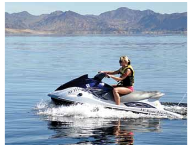
Visitor enjoying a personal watercraft approved for use at Lake Mead National Recreation Area

www.nps.gov/lake/parkmgmt/twostroke.htm .