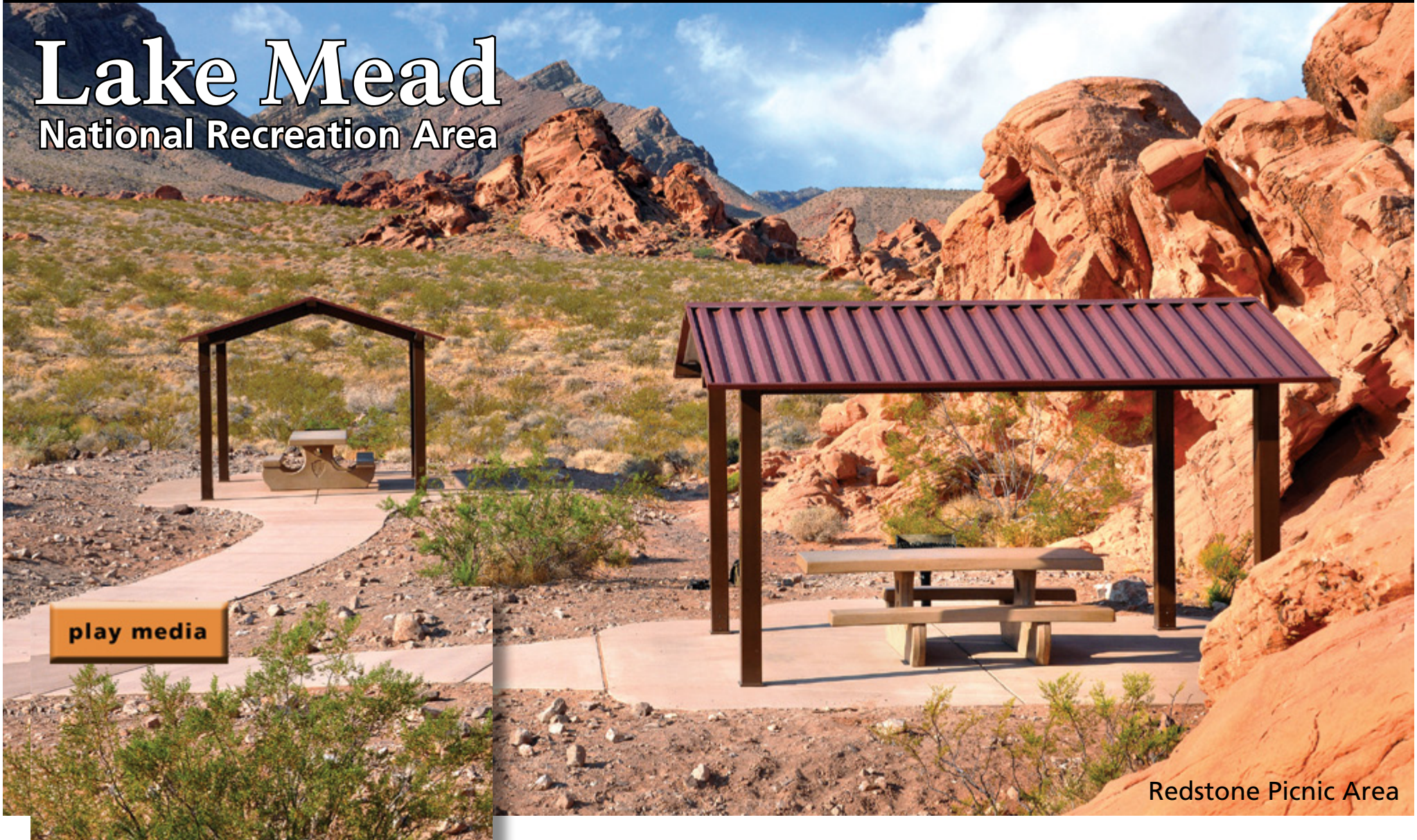
Redstone Picnic Area