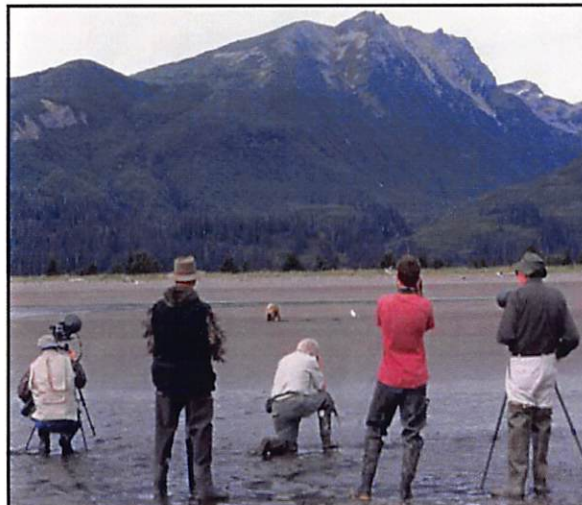
Respect bears' space; do not closely approach, crowd, pursue or displace bears.

The intent of these requirements is to prevent bears and other habituated wildlife from obtaining food and garbage and becoming food-conditioned, and to protect you and the park wildlife.