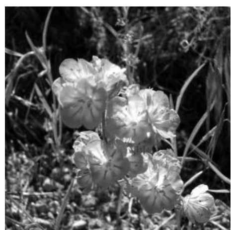
Wildflowers along Missing Link Trail.

The following section includes a summary of issues and concerns raised during the scoping period, organized by topic. Issues that received the greatest number of comments include: ideas about visitor education programs and interpretation opportunities; support for protection of cultural and natural resources; an emphasis on working with surrounding agencies, tribes and communities; preserving the undeveloped character of the park; and ideas for visitor services such as camping.