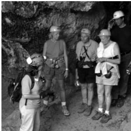
Cave Tour at Lava Beds.

In our first newsletter, we asked you for comments on park purpose and significance statements, the "foundation statement." The foundation statement establishes why the monument was created and why it is nationally significant. Understanding what's most important about a park is a key first step in the planning process.