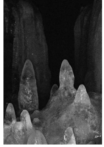
Ice formation in Crystal Ice Cave.