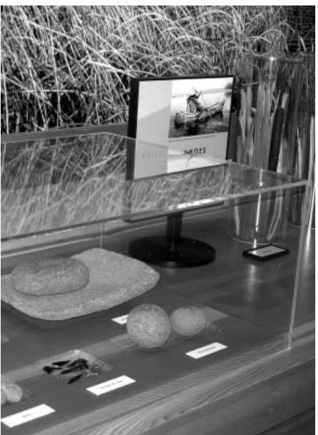
Artifacts at Lava Beds Visitor Center.