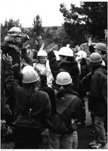
School group at Lava Beds.