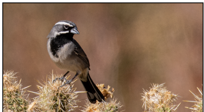
Black-throated sparrow, one of the most commonly observed species in this study.

NDVI is an index of the amount of near-infrared and red light reflected from the surface of plants; this value is linked to such metrics as net primary productivity (how much energy from plants is available to animal consumers). According to the “species-energy theory,” energy availability can explain much of the variation in “species richness”—a key component of biodiversity—in an ecosystem.