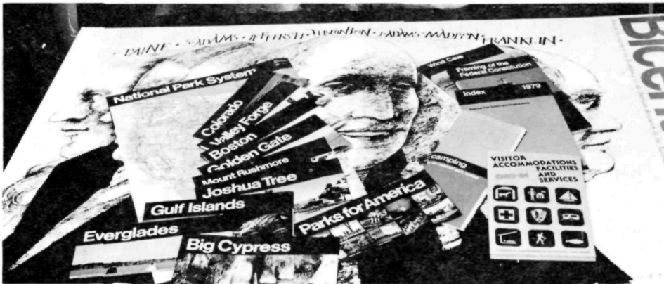
An array of NPS publications are produced at the Harpers Ferry Center, W. Va.