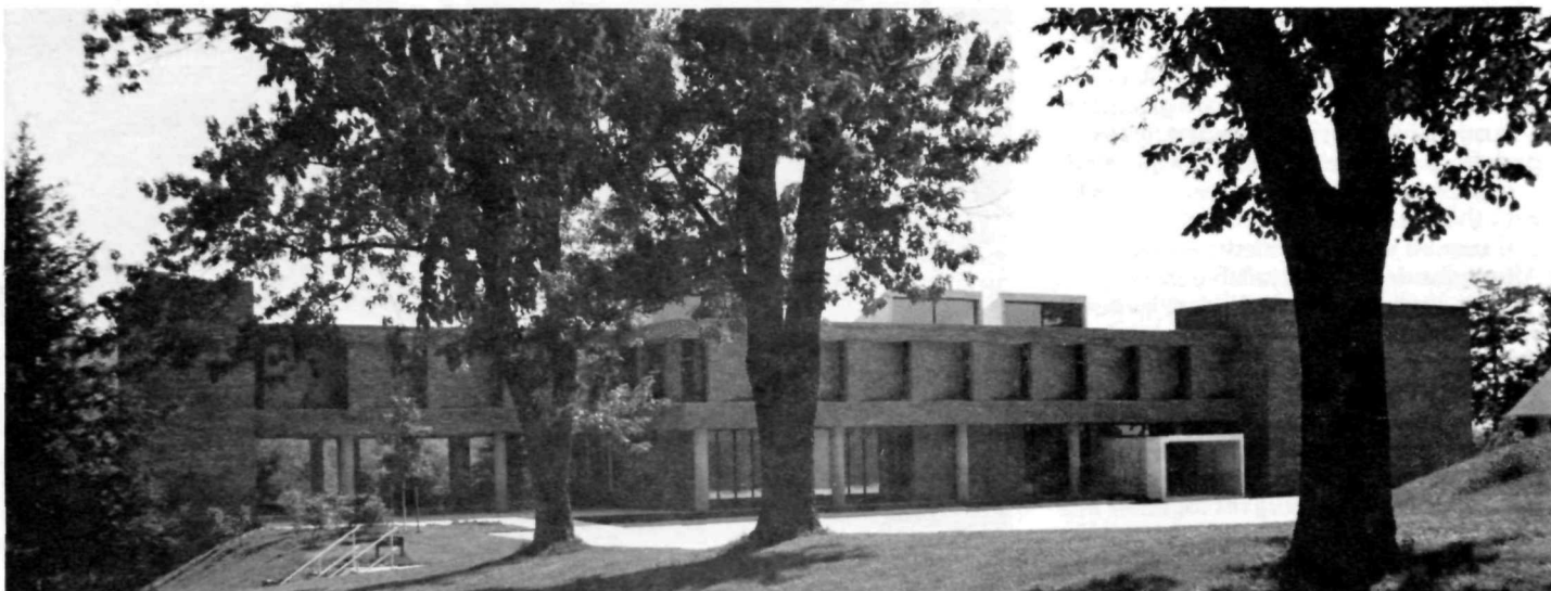
Main building at Harpers Ferry Center, W. Va.