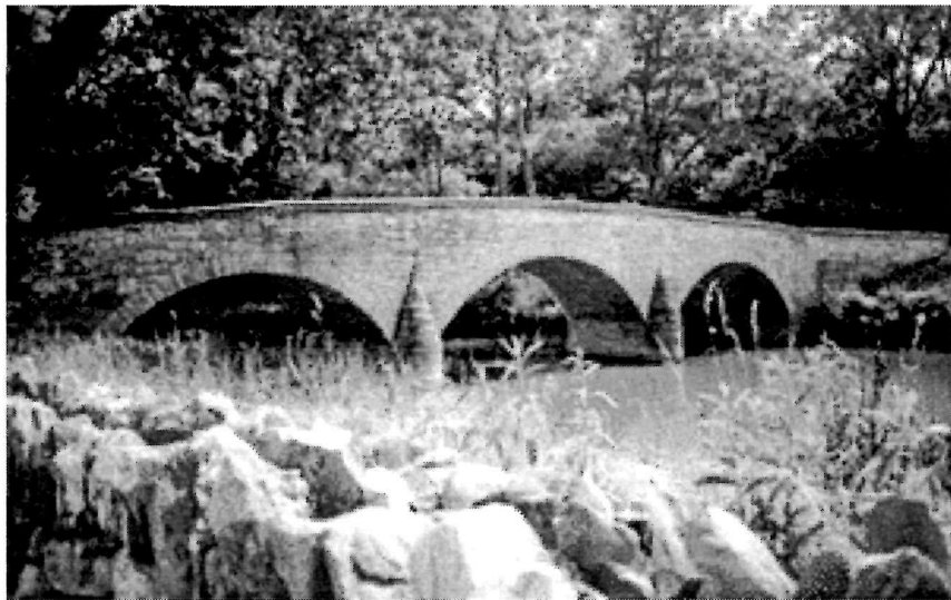
Burnside Bridge at Antietam NB