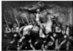
54th Massachusetts Memorial, Boston African-American NHS

In the future interpretive materials must suggest a greater sense of the complexity of the past. History does not possess only one truth, but many truths--and we contribute to the public's knowledge about history, and the special places we manage, by presenting a past with multiple voices, multiple views, and differing, even conflicting, interpretations. In addition, just as historical research should undergo rigorous peer review, so should interpretive programs and products. The history needs to be based on solid and current research and the interpretation needs to accurately and sensitively reflect the research.