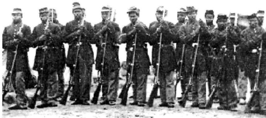
United States Colored Troops

The interpreter’s job is to create the opportunity where visitors, like the “London Guardian” reporter, can discover new meanings or insights that they never suspected were there which lead them on to further discoveries or revelations of their own. The goal is to help visitors move from simply enjoying parks to developing a personal stewardship ethic towards them.