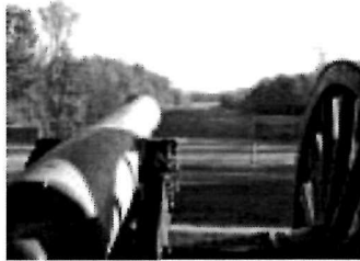
Fredericksburg and Spotsylvania NMP