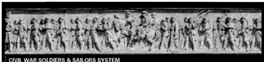
CIVIL WAR SOLDIERS & SAILORS SYSTEM

The National Park Service plans to present to the American public an innovative educational presentation on the Internet, which will offer over 50 million Americans with ancestors who fought in the Civil War a direct family link through the Civil War Soldiers and Sailors System. Using a list of 5.4 million soldier names, this multimedia presentation on the Internet will connect soldier names with regimental histories, battle histories, and to the battlefields and specific monuments and historical markers in the parks where their regiments fought. In a private partnership with the Mormon Church, the Federation of Genealogical Societies, the United Daughters of the Confederacy and other partners, volunteers in over 30 states have completed entering data on over 95% of the 5.4 million soldier names. The first phase of the project is already on the Internet at www.itd.nps.gov/cwss . The existing website includes over 200,000 names of soldiers in the United States Colored Troops (USCT), histories of all of their regiments, and other related historical information. These names were also provided by the NPS to the African American Civil War Memorial project and were used to list all of these names on the Memorial walls.