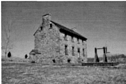
Stone House at Manassas NBP

Any major change in the presentation of programs and the replacement of media will require funding. Some progress in this area has been made at several Civil War sites through the Fee Demonstration Program. In FY 98-99 16 Civil War sites received $1,503,895 that was directed at media replacement and content enrichment. The number of available staff at Civil War sites also has a direct effect on the ability to deliver messages to the public. The complexity of the Civil War story demands a high level of training on the part of NPS historians and interpreters in order to respond in an informed and thoughtful manner to the differing opinions and beliefs held by the visiting public.