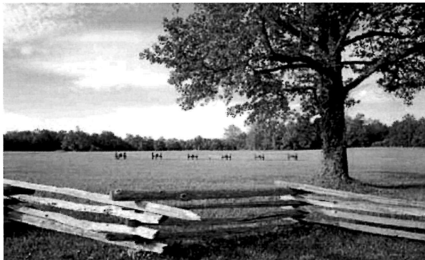
Peach Orchard, Shiloh NMP