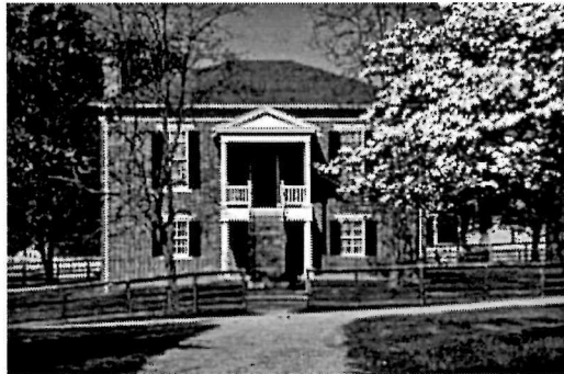
Appomattox Court House NHP