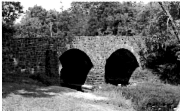
Stone Bridge, Manassas NBP

A series of driving tour brochures on other battlefields associated with the Vicksburg campaign have been produced and one highlighting the military operations in northeast Louisiana, in which United States Colored Troops fought, is being produced. Campaign guides are also being produced that will highlight the role of United States Colored Troops in the Vicksburg campaign and during Union occupation of Vicksburg through Reconstruction. At present, more than 20 titles of scholarly publications on slavery and the role of African-Americans in the Civil War, some of which are designed specifically for children, are offered for sale through Eastern National. Additional titles on African-American Troops and African-Americans are being reviewed and evaluated for sale.