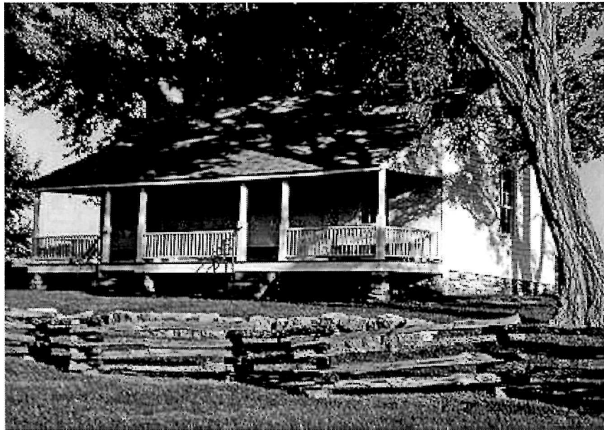
Wilson's Creek NB