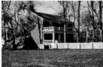
McLean House (surrender site), Appomattox Court House NHP

In 1961, at the outset of the Civil War Centennial, Oscar Handlin observed that, "Again and again, Americans have come back, in their thinking, to the Civil War. Their persistent fascination with that great conflict reveals that it has become a symbol, to which significant meanings adhere. Yet