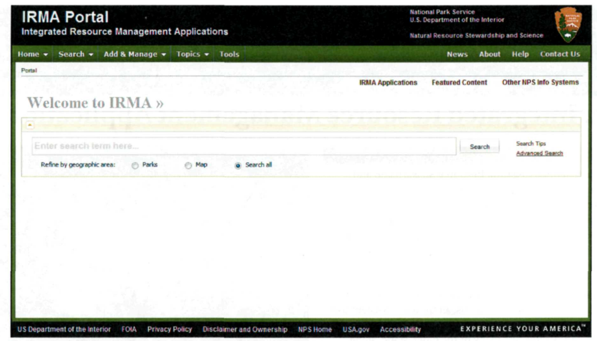
The Integrated Resource Management Applications Website (IRMA): http://irma.nps.gov.