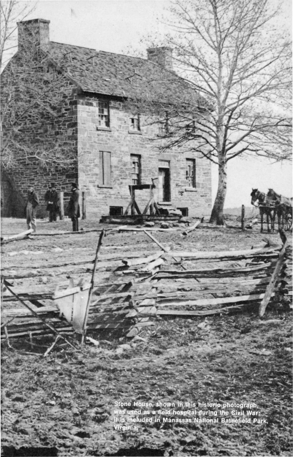
Stone House, shown in this historic photograph, was used as a field hospital during the Civil War; it is included in Manassas National Battlefield Park, Virginia.