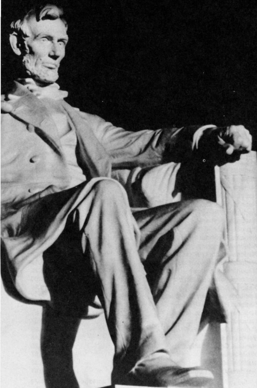
This colossal marble statue of Abraham Lincoln commands the east entrance to the Lincoln Memorial in Washington, D.C.