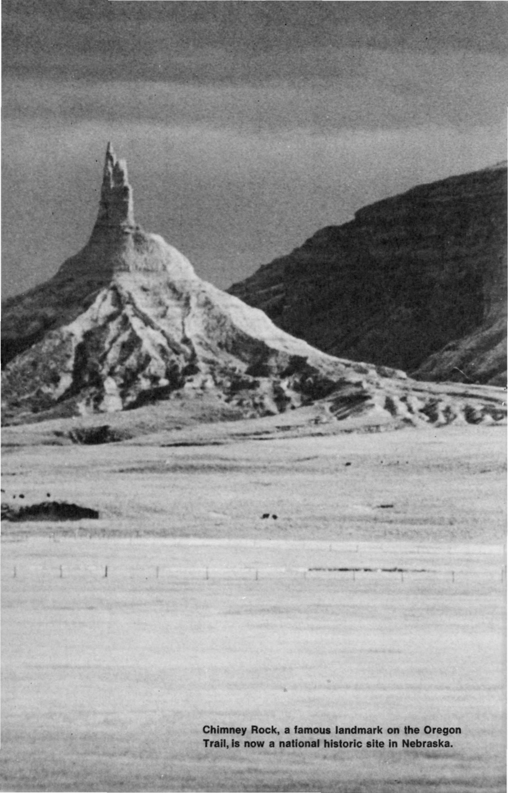
Chimney Rock, a famous landmark on the Oregon Trail, is now a national historic site in Nebraska.