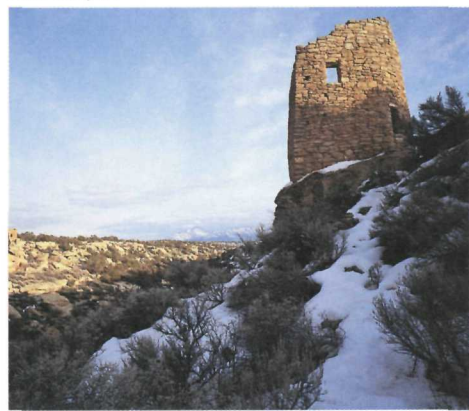
The Twin Towers; also visible in the lower left corner of the picture above

©GPO 2018—403-332/82150 Last updated 2015 Printed on recycled paper.