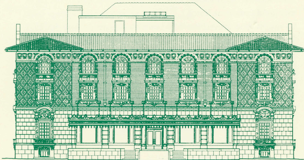
THE FORDYCE BATHHOUSE

U. S. Department of the Interior National Park Service