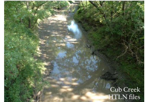
Cub Creek

The National Park Service monitors water quality and aquatic invertebrates, the insect larvae and nymphs, worms, and other animals without backbones living in water, in prairie streams at several Midwestern parks. Monitoring began in Cub Creek at Homestead NM of America (Monument) in 1989. Trends in invertebrate abundance and diversity, particularly for three insect orders intolerant of stream disturbance, can indicate trends in water quality within the creek. Coupling invertebrate community data with measurements of physical characteristics of the creek tells Monument managers important information about stream conditions.