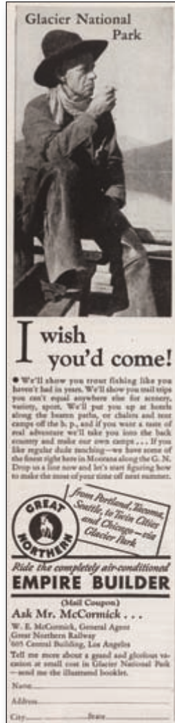
Figure 7. “I Wish You’d Come!” presents the prospect of adventurous outings reminiscent of the Wild West in the national parks of the Mountain West. ( Sunset 74:4 [April 1935]:56)

As late as 1940, the Great Northern could confidently assert that Glacier offered the perfect location in which to enjoy a “Sublime Wilderness” of scenery while engaging in recreations that ranged from hiking and fishing to dancing, cruising and motoring. High in Glacier’s mountains, tourists could live “luxuriously” in the “fine” hotels and chalets of the park. Another advertisement for the park asserted that Glacier had great interest for the tourists because of the “amazing variety” of things to see and do, including such urbane ways to occupy their time as motor coach or motor boat tours, golf and “evening parties” in the “picturesque” accommodations. For