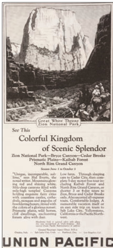
Figure 3. "See This Colorful Kingdom of Scenic Splendor" demonstrates the lush imagery that the Union Pacific used to promote travel to the national parks of the far Southwest. ( Sunset 56:5 [May 1926]: 103)

In the accompanying illustration, the Great White Throne dominates the whole scene. Framing it on three sides, lesser slabs of dark stone rise up like ruined staircases leading up to the edge of the throne. Below it all lies a wide valley with a winding dirt trail leading off through the scrub brush towards the