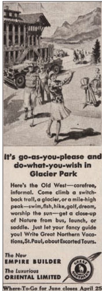
Figure 6. "It's go-as-you-please and do-what-you-wish in Glacier Park" reflects the mixture of the rustic and the refined that railroads and other park concessionaires frequently promised their customers. ( Harper's Magazine 162:6 [May 1931]: n.p.)

Unlike the automobile and its passengers, seen at close range in considerable detail, the approaching riders themselves are completely anonymous, seen, it appears, from a significant distance. It is only after studying the entire sketch for a moment that the viewer realizes the riders and their mounts are disproportionately smaller than their immediate surroundings, which in turn creates an illusion of greater distance. Thus the riders resemble figures added to a painting as an afterthought, inserted for a different purpose. Trail riding actually remained an extremely popular pastime for many years at Glacier but, as here portrayed, it clearly took a back seat to more urbanized recreations such as golf or motor touring. Similarly, the illustrator threw into opposition the symbols of civilization and wilderness that composed his back-