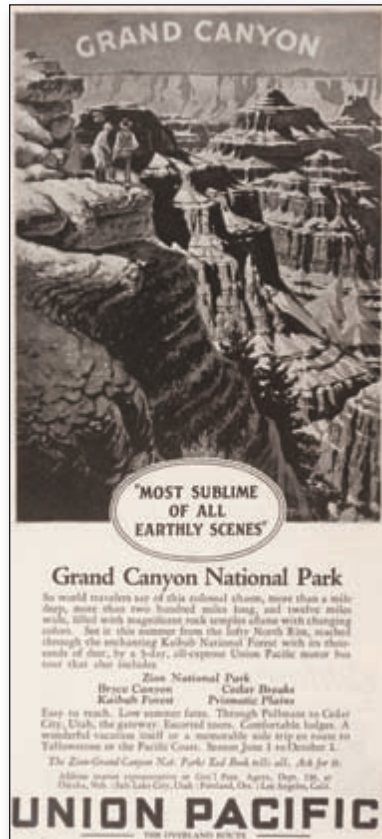
Figure 4. "Most Sublime of All Earthly Scenes" focuses upon the appeal of the Grand Canyon's indescribably magnificent scenery as crafted for tourists by the Union Pacific Railroad. ( Sunset 58:5 [May 1927]:95)

For those who might delight in alpine meadows bedecked with wild flowers or in cerulean mountain lakes, the beauty of the Great White Throne and its arid setting might have been an elusive quality to grasp. Nonetheless, the artist engaged to reproduce that beauty on the printed page used several familiar techniques to impress the viewer even if he or she might not be instantly converted. Like his counterpart who had portrayed the Pacific Northwest, this artist effectively employed contrasting colors. Fixed in the middle of the sketch, the Great White Throne juttured up from its surroundings to present an alabaster escarpment to the viewer. The darker formations that enclosed it set it off like a pearl against black velvet and drew the viewer's attention directly to the massive formation. At the same time, the cluster of riders located in a corner of the foreground enhanced the visual impact