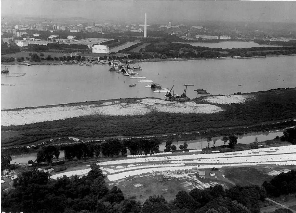
Figure 3. This aerial view in mid-1928 shows the pier foundations in place. The large storage area needed for the granite facing stones is in the foreground. (NARA RG 42)