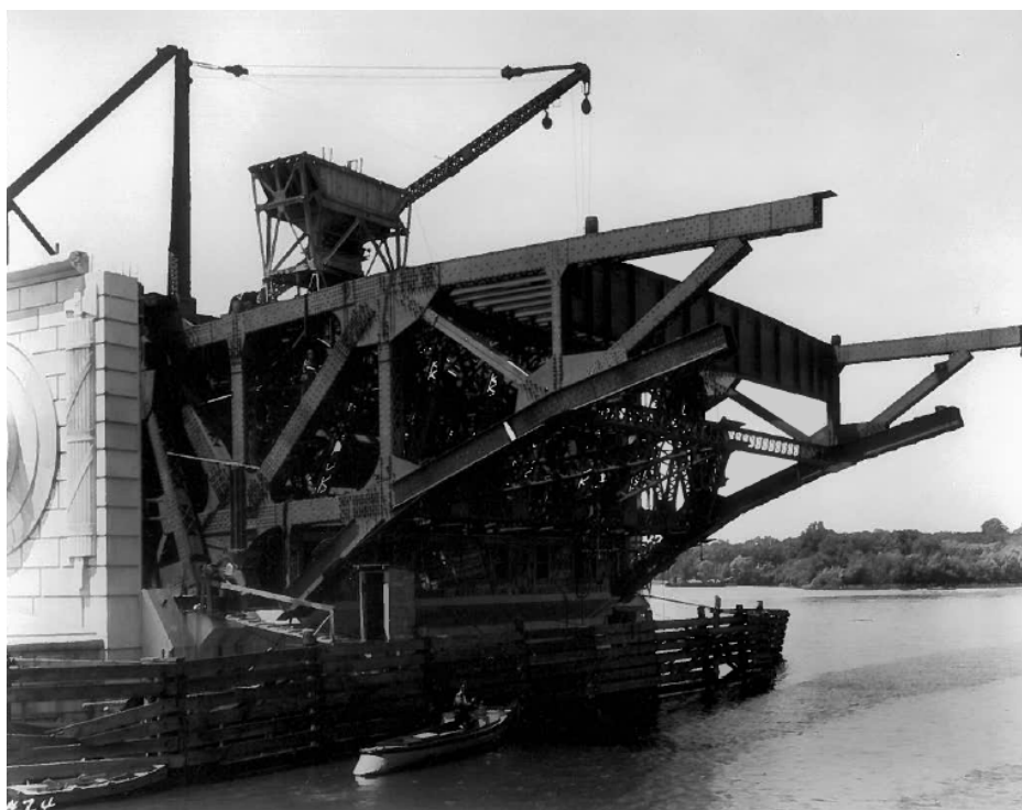
Figure 4. Each leaf of the bascule span was assembled with rivets from components fabricated at Phoenix Bridge's shop. The east leaf was erected first, and then raised to provide clearance for ships while the west leaf was being built.