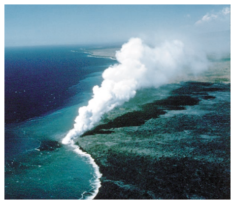
Molten lava from Kīlauea Volcano frequently flows through underground lava tubes to reach the Pacific Ocean, where it vigorously reacts with cold seawater to create large steam plumes laden with hydrochloric acid. These plumes, known as "laze", are another form of volcanic air pollution and pose a local environmental hazard along the Island of Hawai'i's southeast coast, especially to people who visit these ocean-entry sites.

Many residents and visitors on the Island of Hawai'i report physical complaints associated with vog exposure. These complaints include headaches, breathing difficulties, increased susceptibility to respiratory ailments, watery eyes, sore throat, flu-like symptoms, and a general lack of energy. In contrast to SO_2 gas concentration near Kīlauea, the amount of aerosol particles in Hawai'i's air does not routinely exceed Federal standards, but the unique combination of acidic particles, trace amounts of toxic met-