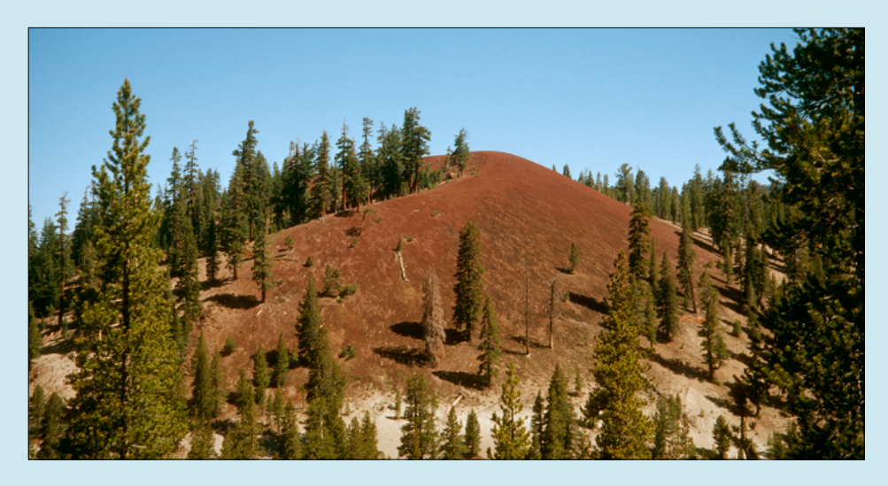
One of the twin basaltic cinder cones, called Red Cones, 3 miles southwest of Mammoth Mountain.

250,000 years, and the last eruption was 8,000 years ago. Time gaps between eruptions are variable, and we never expect eruption frequency to be strictly regular. We cannot predict exactly when the next eruption will take place, but the USGS California Volcano Observatory has a network of seismometers, ground deformation detectors, and gas sensors in place that give us real-time alerts about unrest beneath the volcanic field.