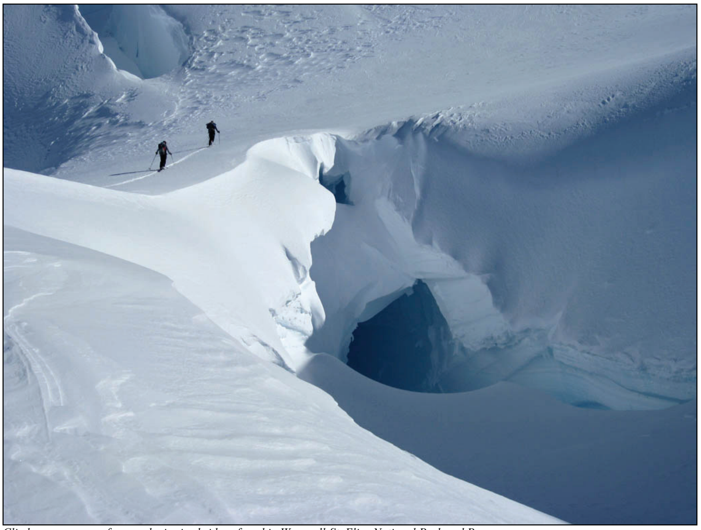
Climbers cross one of many glacier ice bridges found in Wrangell-St. Elias National Park and Preserve.

Appendix A — Legislation Appendix A includes selected excerpts from ANILCA that are most relevant for the day to day management of Wrangell-St. Elias National Park and Preserve.