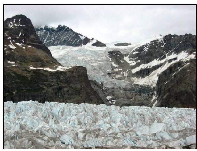
Glaciers in upper Kennicott Glacier Valley.

The park and preserve ensures the opportunity to explore, learn from, and add to the body of scientific research in regards to glacial systems.