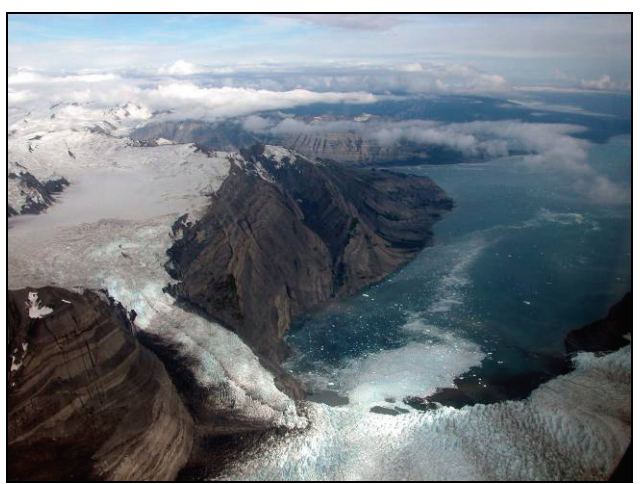
Wrangell-St. Elias National Park and Preserve contains a variety of ecosystems.

Moose, Dall's sheep, caribou, mountain goat, wolf, grizzly bear, black bear, lynx, wolverine are some of the species that live within the park and preserve.