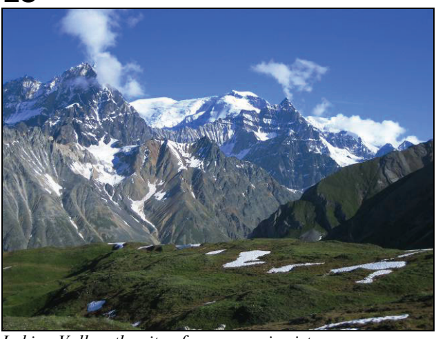
Lakina Valley, the site of many scenic vistas.

Natural, undeveloped viewsheds, including water bodies and landforms dominate the viewscape of Wrangell-St. Elias National Park and Preserve.