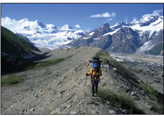
Backpackers following a lateral morraine west of Kennicott Glacier.

Trails, airstrips, and landings provide access to remote wilderness.