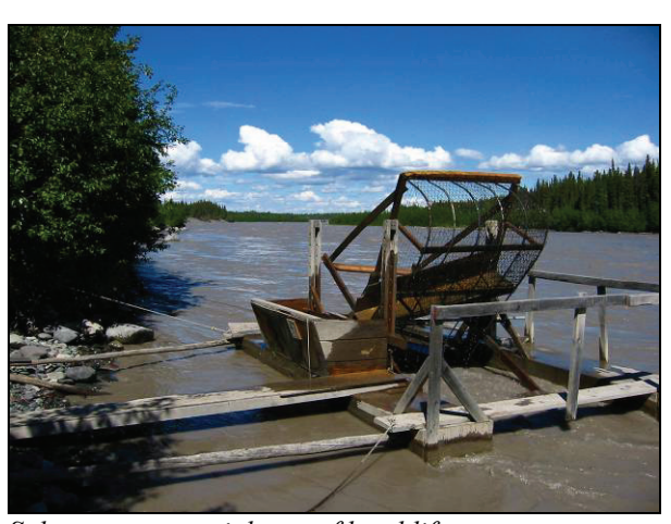
Salmon are a crucial part of local lifeways.

Access for subsistence users, commercial fishermen, private property owners, and those engaged in traditional activities.