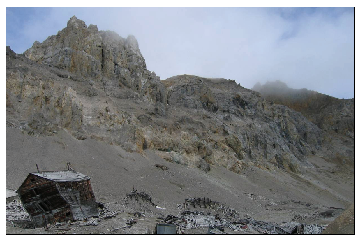
The ruins of Kennecott's Jumbo Mine camp rest on Bonanza Ridge.