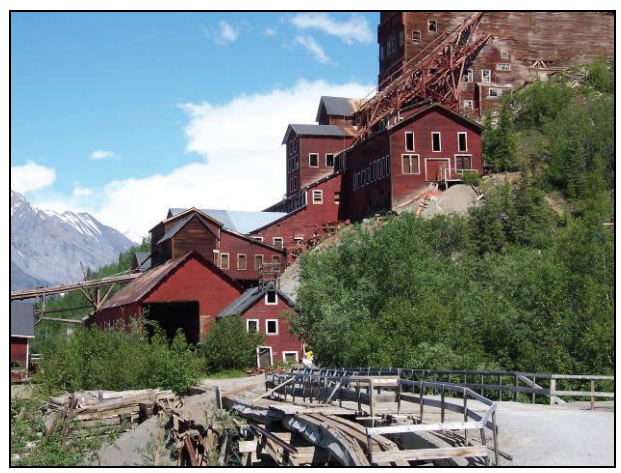
The Kennecott mill town is one of the park's most iconic features.

The park maintains collections, which include cultural objects, photographs, oral histories, historic resource maps, archives and natural collections of flora and fauna specimens.