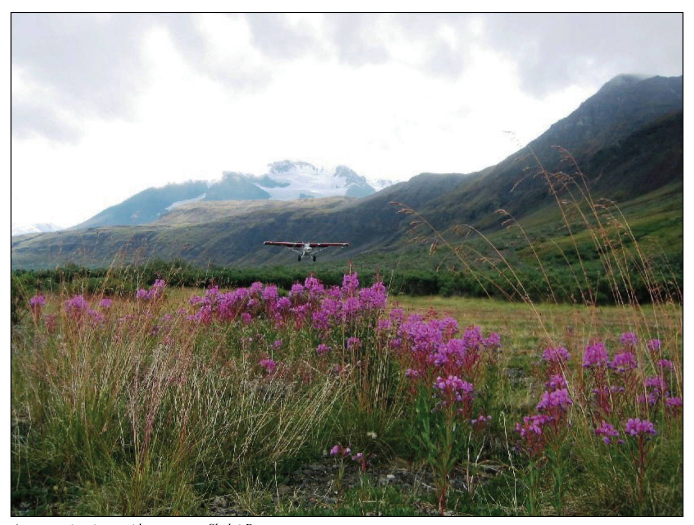
A remote airstrip provides access at Skolai Pass.

Appendix B includes legislation that, while superseded by ANILCA, offers contextual background information regarding the establishment of Wrangell-St. Elias National Park and Preserve.