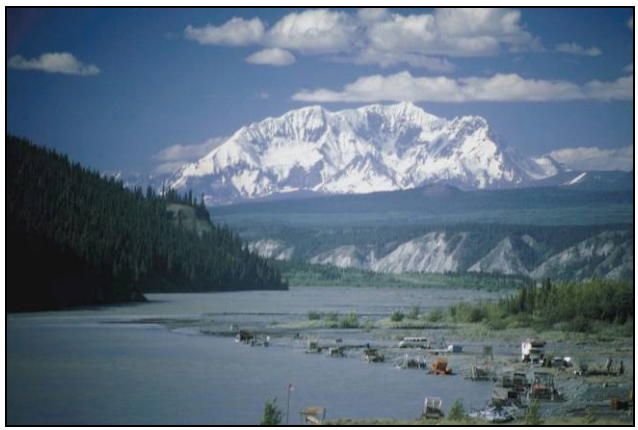
Fishwheels turn on the Copper River near Chitina, with Mt. Drum in the background.

Wrangell-St. Elias National Park and Preserve provides the opportunities to learn about the glacial river systems, and to perform scientific research regarding them.