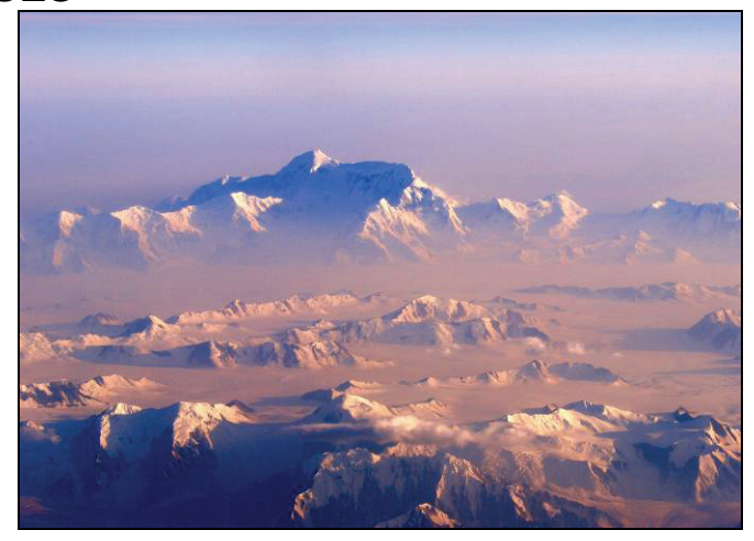
Mount St. Elias rises above the surrounding mountain range.

Wrangell-St. Elias National Park and Preserve provides opportunities to learn about the earth's history and geologic processes, and to perform scientific research.