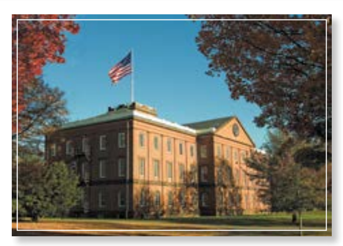
Built in the mid-19th century for storage and maintenance of weapons, this building holds the visitor center, museum, collection, and staff offices.