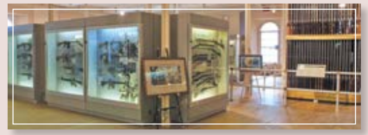
The exhibits of the museum and visitor center.