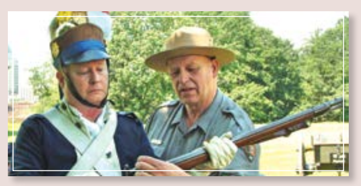
A ranger describes the details of a Revolutionary War era weapon to visitors.