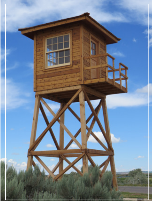
The reconstructed Guard Tower stands as a symbol of incarceration.

The purpose of MINIDOKA NATIONAL HISTORIC SITE is to provide opportunities for public education and interpretation of the exclusion and unjust incarceration of Nikkei—Japanese American citizens and legal residents of Japanese ancestry—in the United States during World War II. Minidoka National Historic Site protects and collaboratively manages resources related to the Minidoka War Relocation Center in Idaho and the Bainbridge Island Japanese American Exclusion Memorial in Washington State.