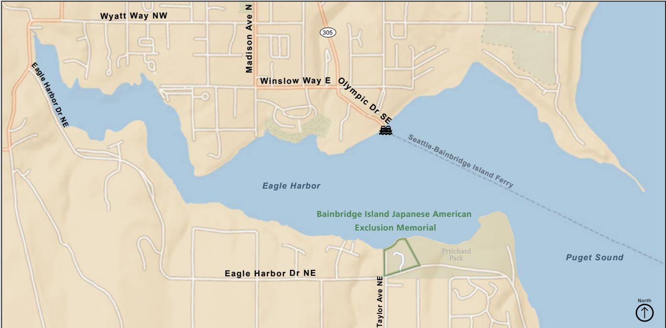
Bainbridge Island Japanese American Exclusion Memorial