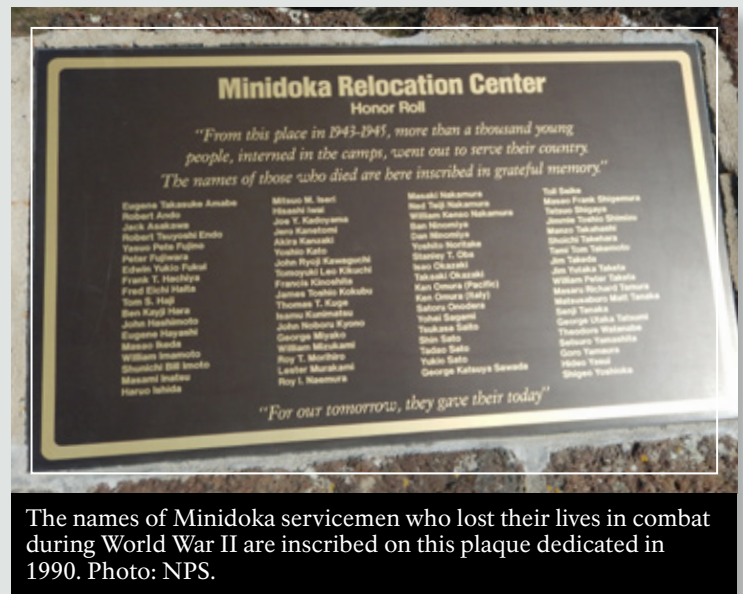
The names of Minidoka servicemen who lost their lives in combat during World War II are inscribed on this plaque dedicated in 1990.