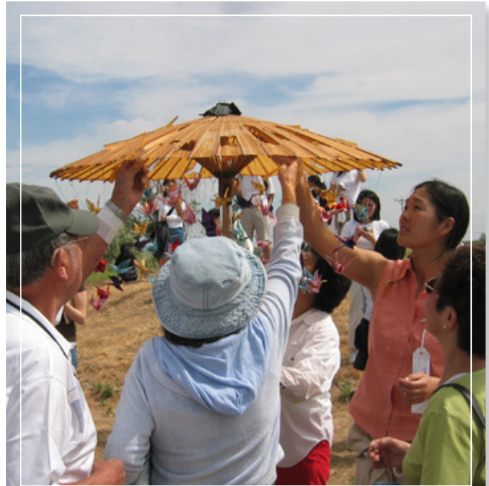
In 2004 at the annual pilgrimage, pilgrims attach paper cranes to the parasol in memory of loved ones.