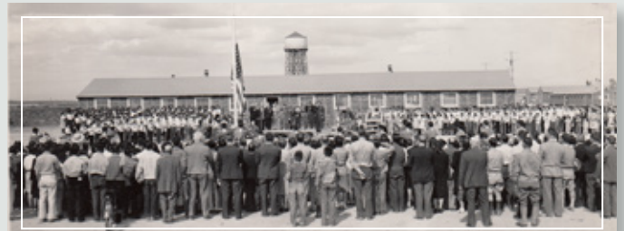
Local community leaders joined center staff and residents in dedicating a flagpole on April 20, 1942.