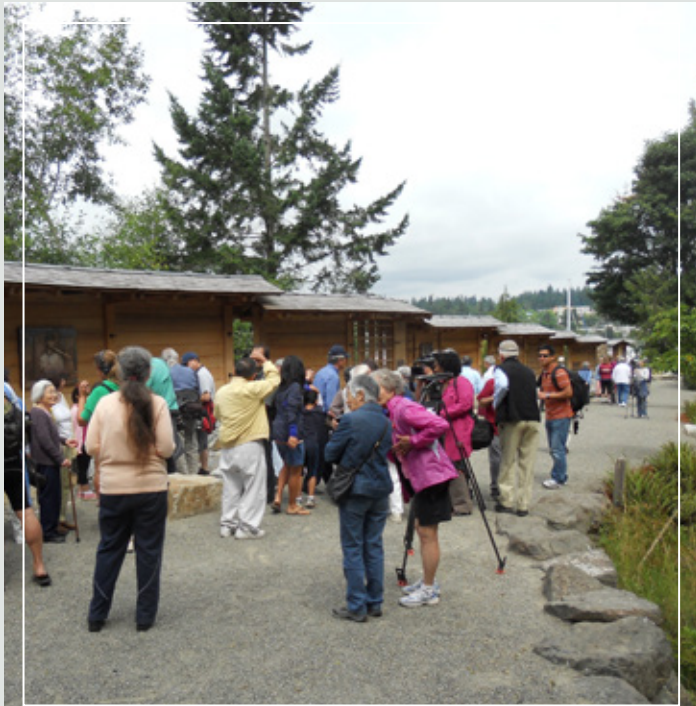
The Bainbridge Island Japanese American Exclusion Memorial was dedicated on August 6, 2011.