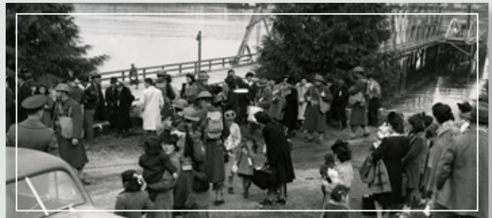
Japanese American families wait at the Eagledale Ferry Dock on Bainbridge Island on March 30, 1942.