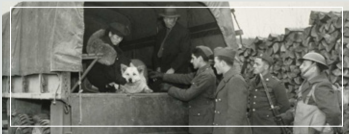
Japanese American family forcibly removed from their home on Bainbridge Island. Soldiers removed their dog from the truck because families were not allowed to take pets with them.