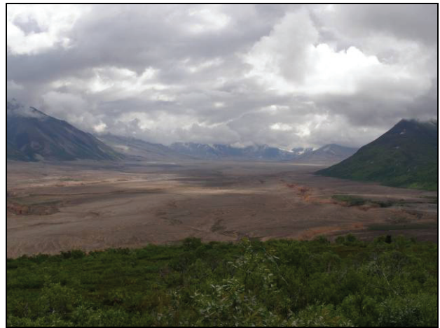
The Valley of Ten Thousands Smokes has played an important role in volcanology for many decades.