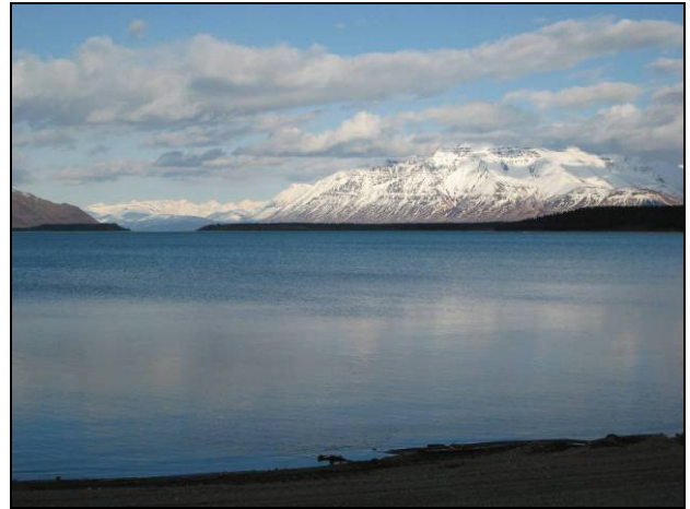
The lakes and rivers of Katmai National Park and Preserve have served as the foundation for life in the region for thousands of years.

The park preserves watersheds that have been important to humans by serving as travel corridors, defining territories, and sustaining populations through time.