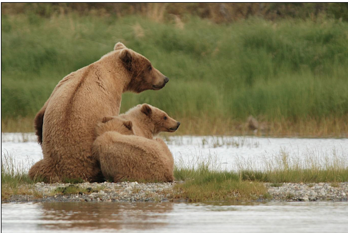
A family of Katmai National Park and Preserve's iconic brown bears rests near Brooks Camp.