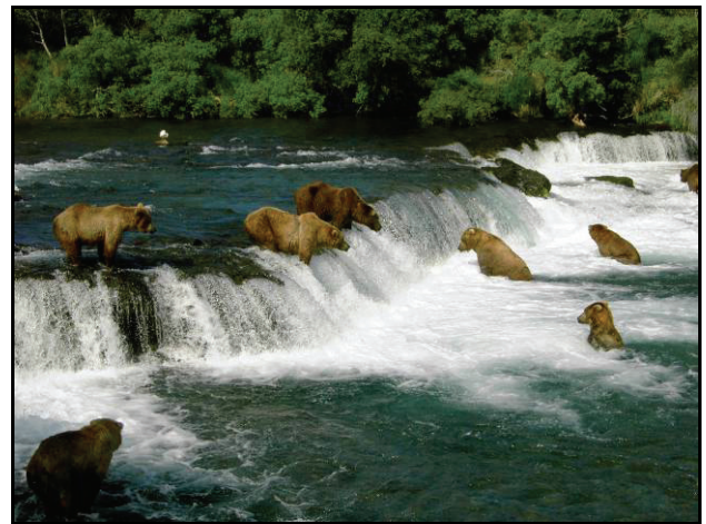
Katmai National Park and Preserve is one of the best places in the world to view brown bears.