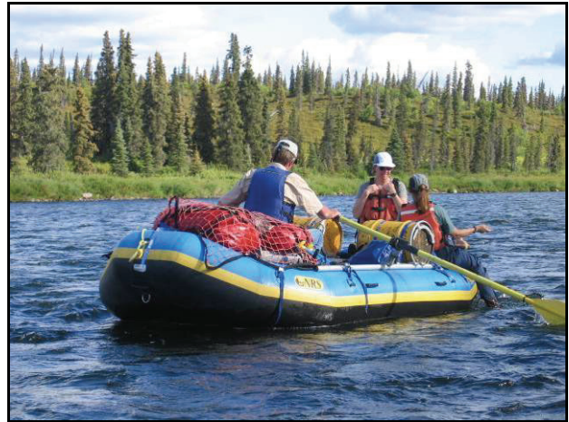
Katmai National Park and Preserve is known for its exceptional recreational floating opportunities.