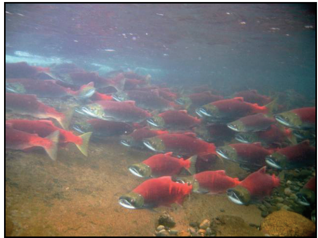
Sockeye salmon turn red when they reach the end of their lifecycle.

The salmon runs of Bristol Bay, including those from rivers that originate in Katmai National Park and Preserve, serve as a laboratory for progressive fisheries management.