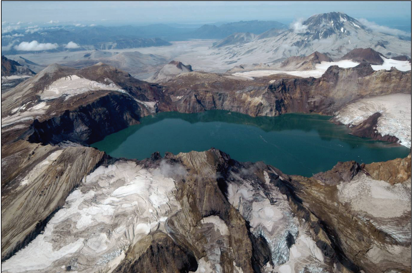
Katmai Caldera with Mt. Griggs in the background.

Appendix B includes legislation that, while superseded by ANILCA, offers contextual background information regarding the establishment of Katmai National Park and Preserve.