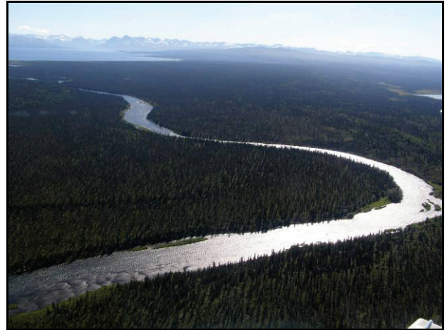
The Alagnak Wild River is one of the Bristol Bay region's most popular tourist destinations.