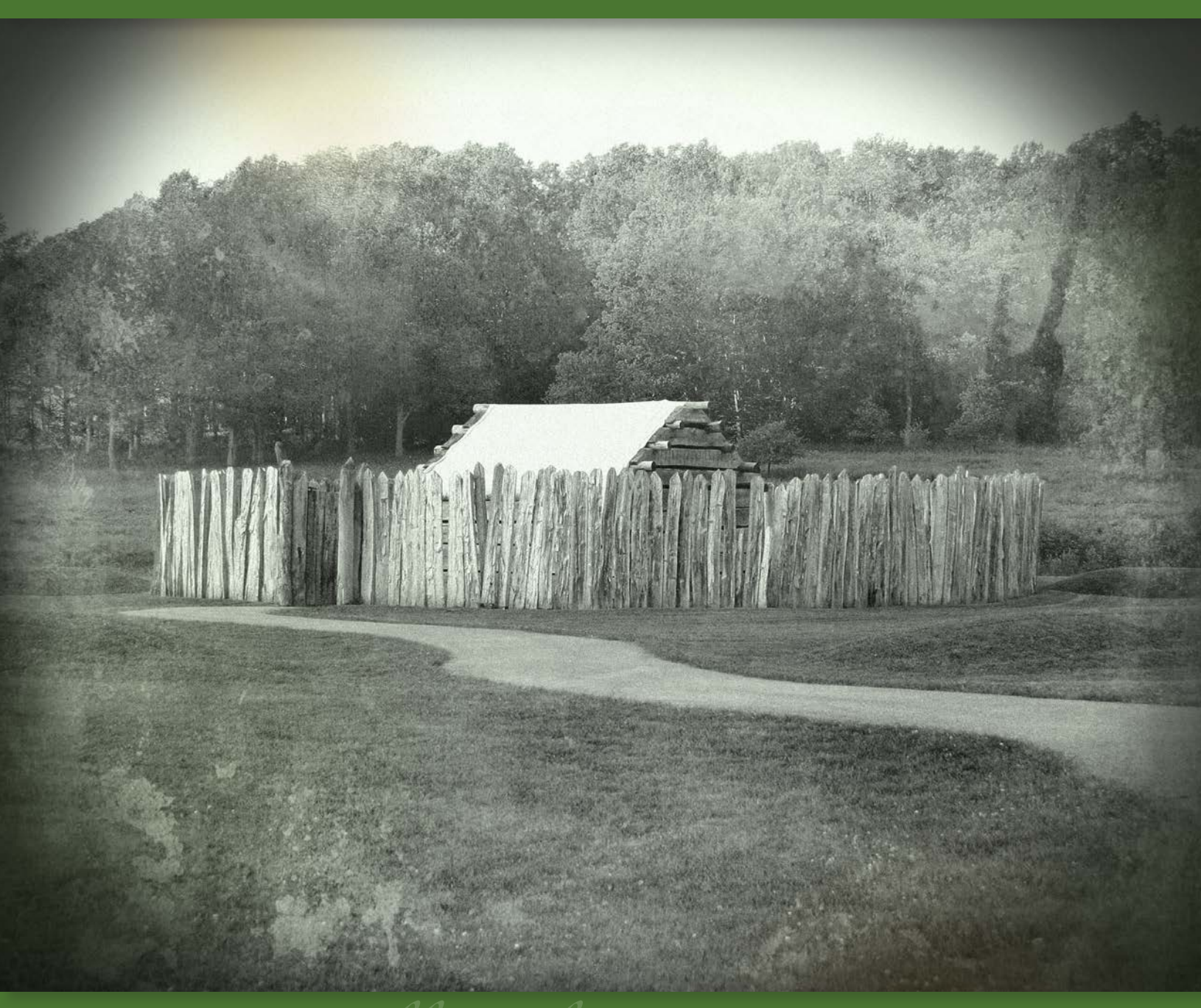
Jumonville Glen George Washington The National Road