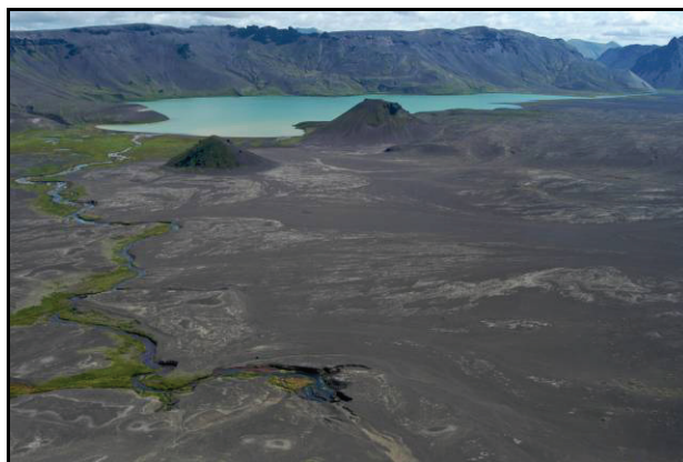
The hot springs-fed Surprise Lake is part of a dynamic, volcanically dominated landscape.

The park provides opportunities to study volcanism (such as caldera formation), tectonic activity, and other geologic processes.