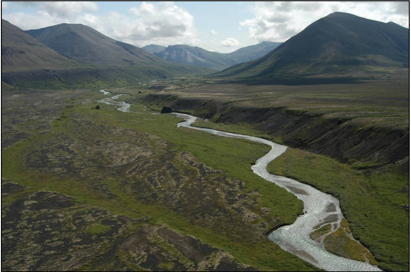
The Aniakchak River meanders across a dramatic landscape.

Appendix A includes selected excerpts from ANILCA that are most relevant for the day to day management of Aniakchak National Monument and Preserve.