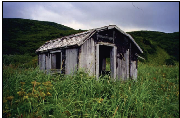
The Kujulik cabin at Aniakchak Bay marks one phase of human occupation in the preserve.

Aniakchak National Monument and Preserve provides opportunities for local rural residents to engage in customary and traditional subsistence uses.