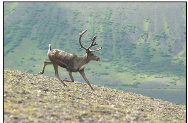
Caribou are frequent visitors along the rim of Aniakchak Caldera.