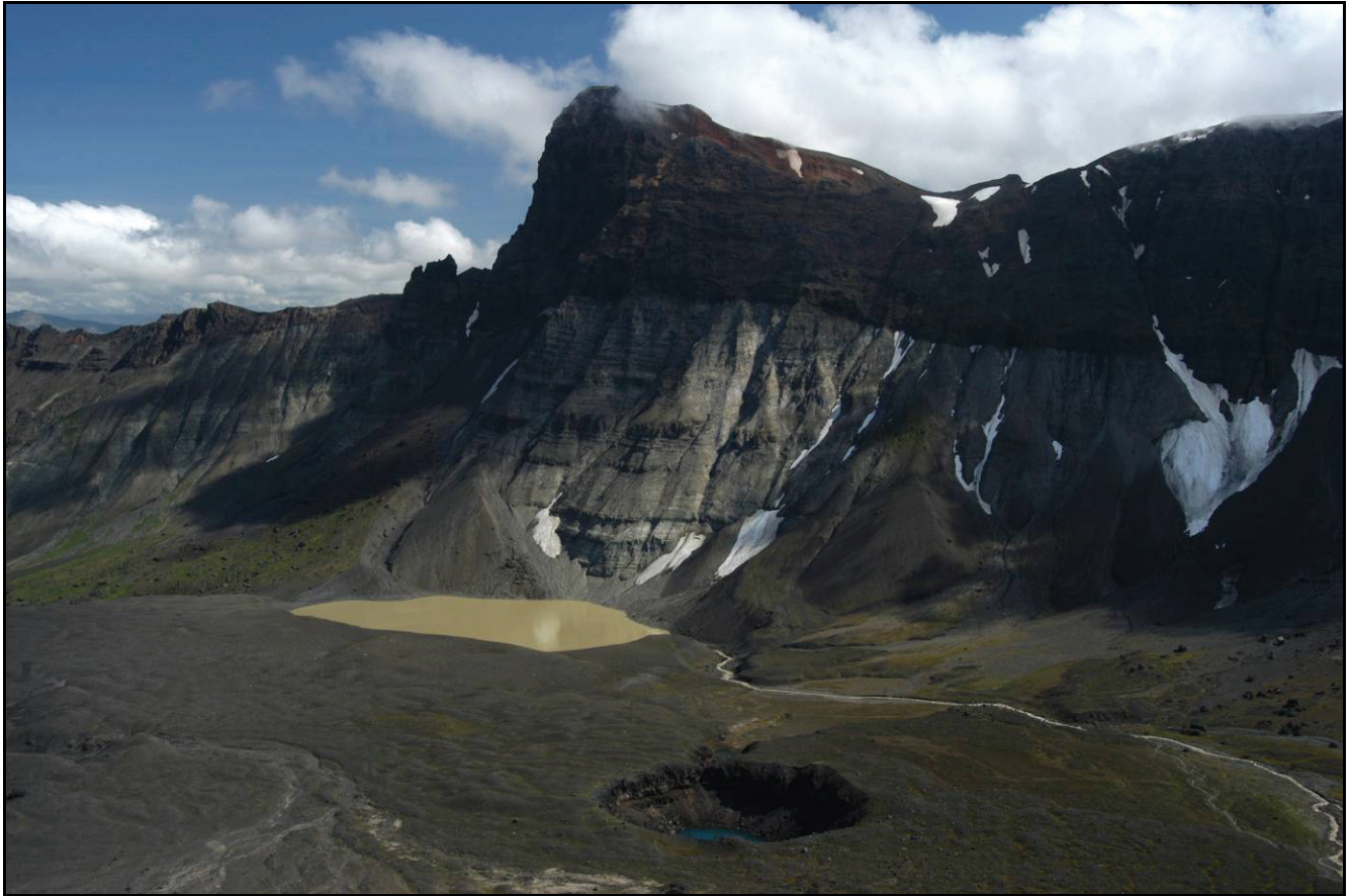
The Aniakchak Caldera's spectacular scenery is shaped by volcanic activity.

Appendix B includes legislation that, while superseded by ANILCA, offers contextual background information regarding the establishment of Aniakchak National Monument and Preserve.