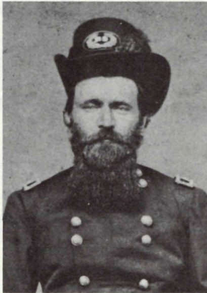
Brig. Gen. Ulysses S. Grant