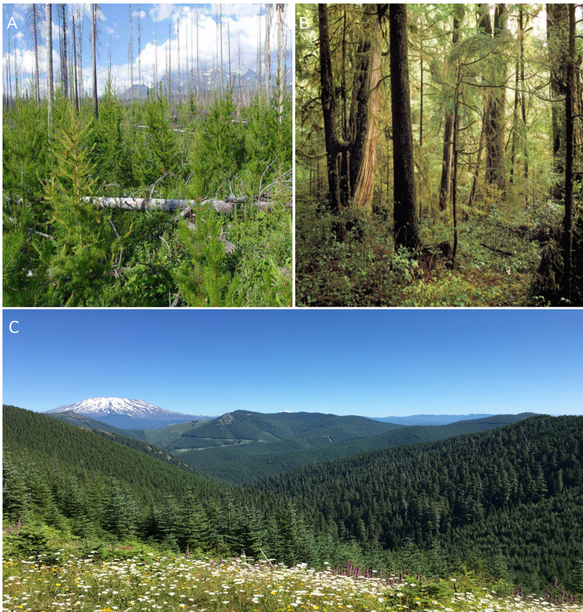
Fig. 1. Examples of stand-replacing systems where wildfires tend to be more limited by ignition source and weather rather than fuel. (A) A naturally regenerated lodgepole pine ( Pinus contorta var. latifolia ) patch ~10 yr post-fire, (B) an old-growth western red cedar ( Thuja plicata ) and western hemlock ( Tsuga heterophylla ) stand (photograph used with permission, Van Pelt 2008), and (C) a multi-aged and partially managed Douglas-fir ( Pseudotsuga menziesii ) and noble fir ( Abies procera ) forest consisting of both recently harvested patches (right foreground and far background), 115 yr-old patches originating from a 1902 wildfire (left foreground), and old-growth patches that escaped the 1902 fire (above the recent harvest on right).

alter ecosystem composition and structure, because they start from a very low number (i.e., the low annual area burned of the current and/or historic eras). Moreover, because these forests are