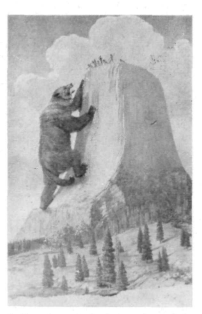
Indian legend depicting the origin of Devils Tower.

Poster issued by the General Land Office warning visitors not to vandalize Devils Tower.