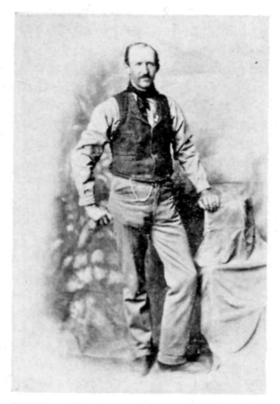
William Rogers. Courtesy National Park Service.

Handbill of first exhibition ascent of Devils Tower, July 4, 1893. Courtesy National Park Service.