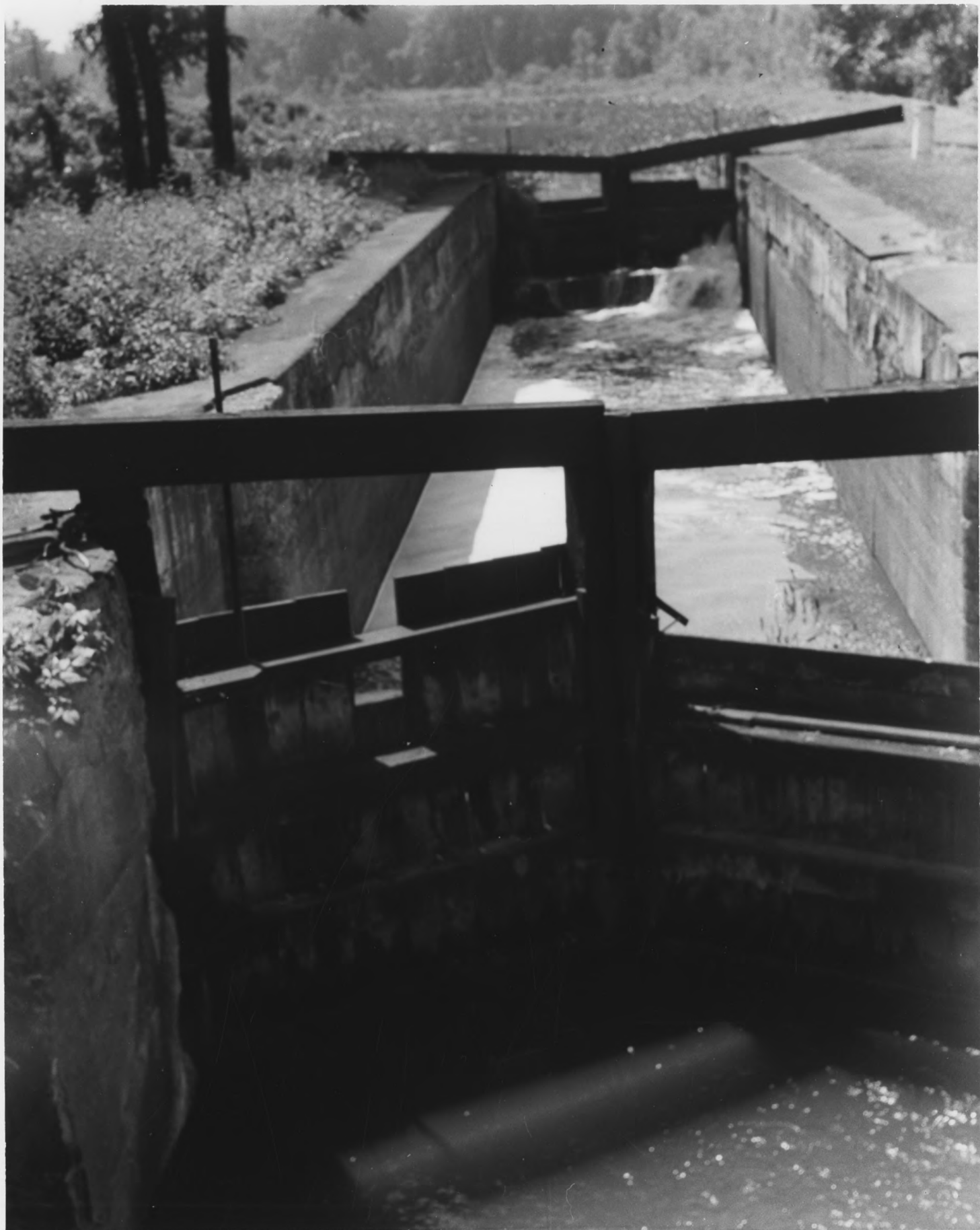
Lock 38, Ohio and Erie Canal, Ohio