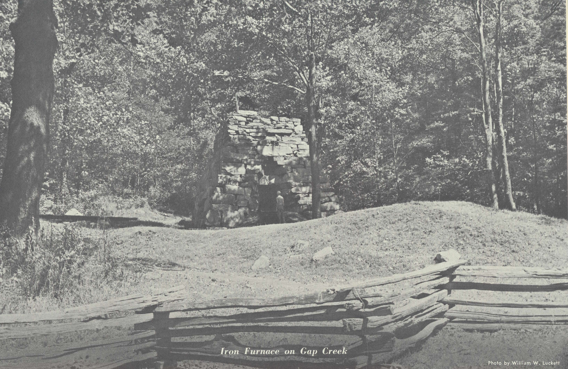
Iron Furnace on Gap Creek