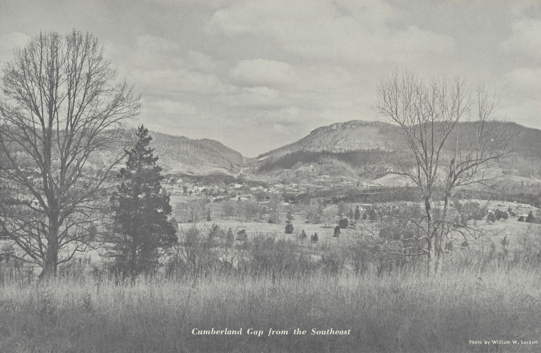
Cumberland Gap from the Southeast