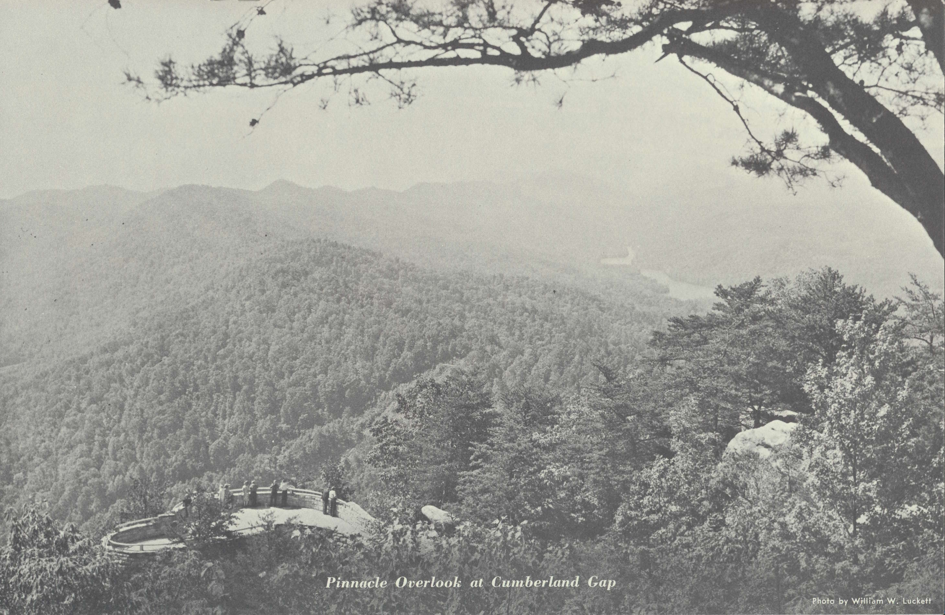
Pinnacle Overlook at Cumberland Gap