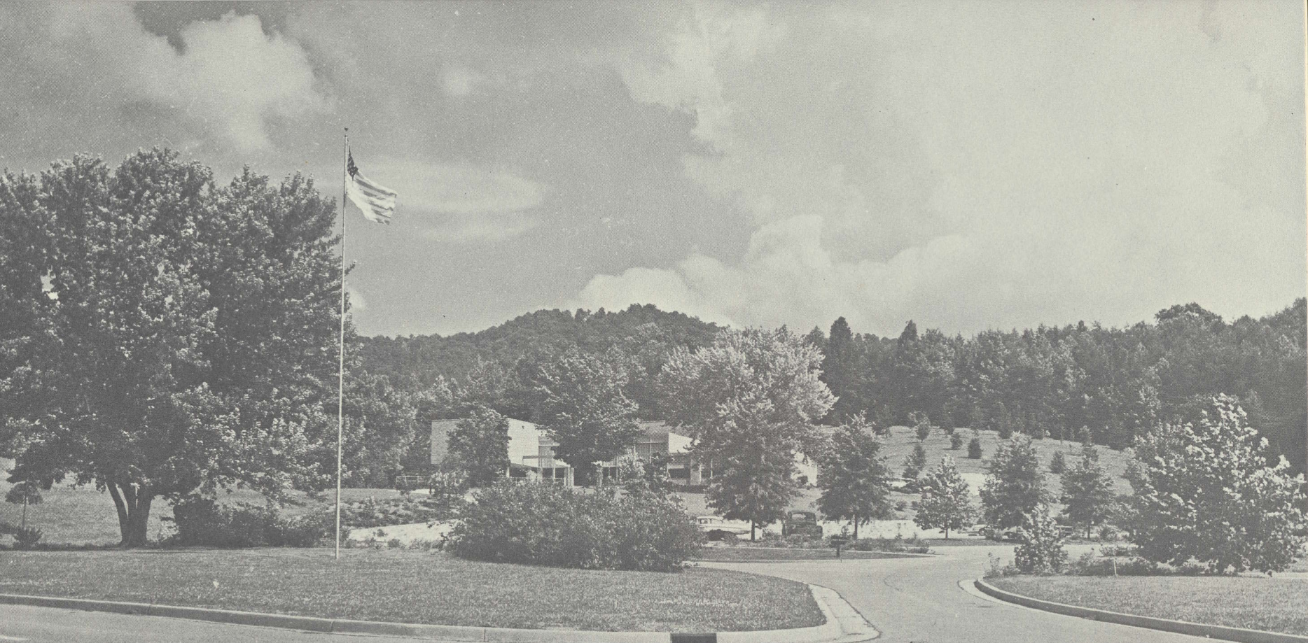
Visitor Center, Cumberland Gap National Historical Park