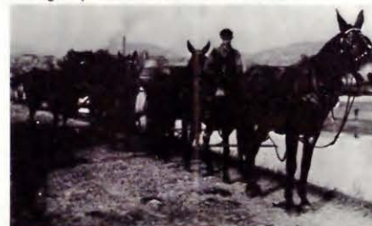
Canalboats at Williamsport wait for their next haul.