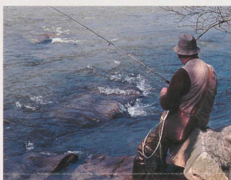
Opportunities abound for a wide range of activities on land and water. Fish, such as the brook rainbow (right), and brown trout, thrive in the cold waters of the Chattahoochee.