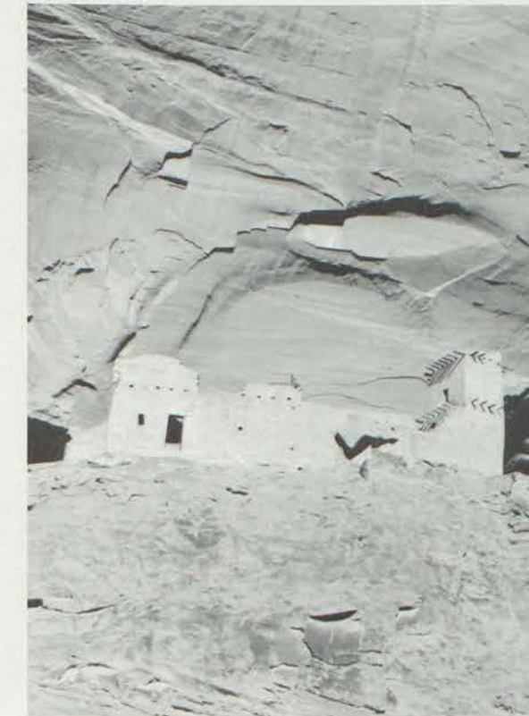
Mummy Cave Ruin

About 1700 the Navajo Indians, who were then concentrated in northern New Mexico, began to occupy Canyon de Chelly. An aggressive people related culturally and linguistically to the various Apache Indians in the Southwest, they raided for a century and a half the Pueblo Indian villages and Spanish settlements along the Rio Grande Valley. These attacks inspired the successive governments of New Mexico (Spanish, Mexican, and American)