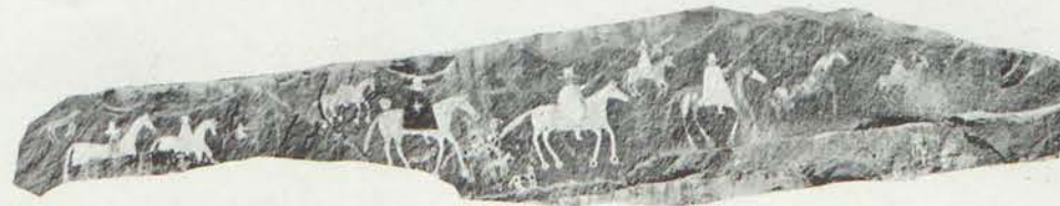
Part of the colorful Navajo painting at Standing Cow Ruin

During the 1200's, a prolonged drought parched what is now the Four Corners region of Arizona, Utah, Colorado, and New Mexico. About 1300, the drought, and perhaps other causes, forced the people of Canyon de Chelly and other nearby Pueblo centers to abandon their homes and scatter to other parts of the Southwest. Some of the present-day Pueblo Indians of Arizona and New Mexico are descendants of these pre-Columbian people.