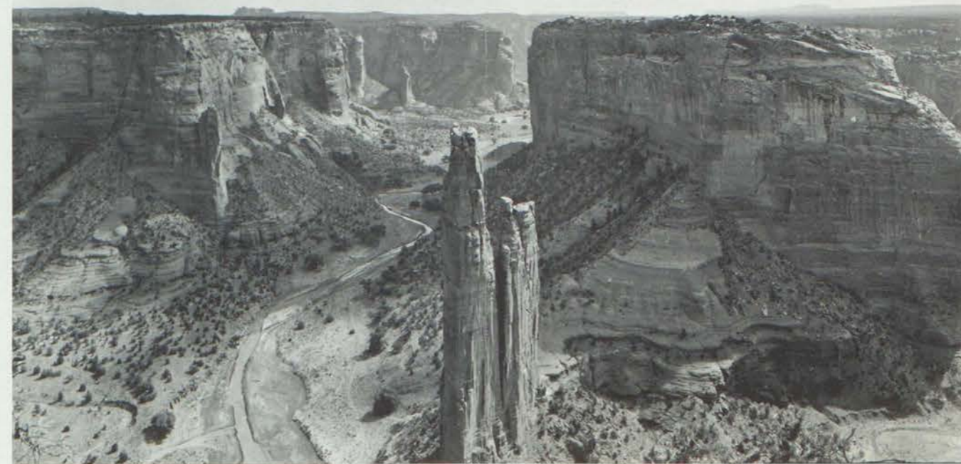
Spider Rock and view of Canyon de Chelly from the rim

U. S. Department of the Interior National Park Service REVISED 1970 ☆U.S. GOVERNMENT PRINTING OFFICE: 1970-435-396/26