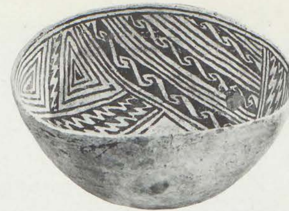
Decorated general-purpose pottery bowl