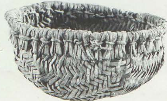
Ring basket of split yucca leaves. A type in common use from at least A.D. 1100 to the present.

In later centuries, the Basketmakers adopted many new ideas which were introduced into this area, such as the making of pottery, the bow and arrow, and bean cultivation. The style of their houses gradually changed through the years until finally they were no longer living in pithouses but were building rectangular houses of stone masonry above the ground which were connected together in compact villages. These changes basically altered Basketmaker life; and, because of the new "apartment house" style of their homes, the canyon dwellers after 700 are called Pueblos. Pueblo is the Spanish word for village, and it refers to the compact village life of these later people. Most of the large cliff houses in these canyons were built between 1100 and 1300, in the Pueblo period.