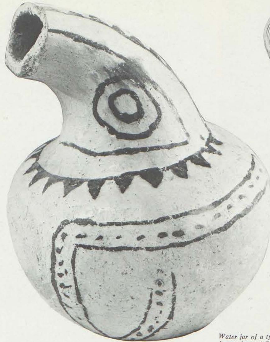
Water jar of a type used from about A.D. 900 to 1150.