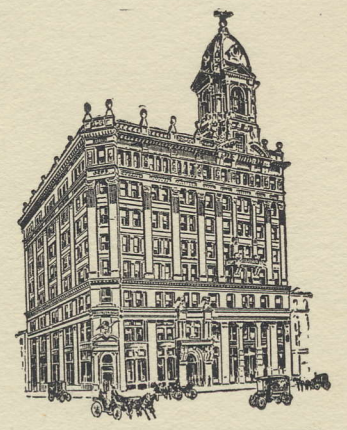
BROOKLYN EAGLE BUILDING