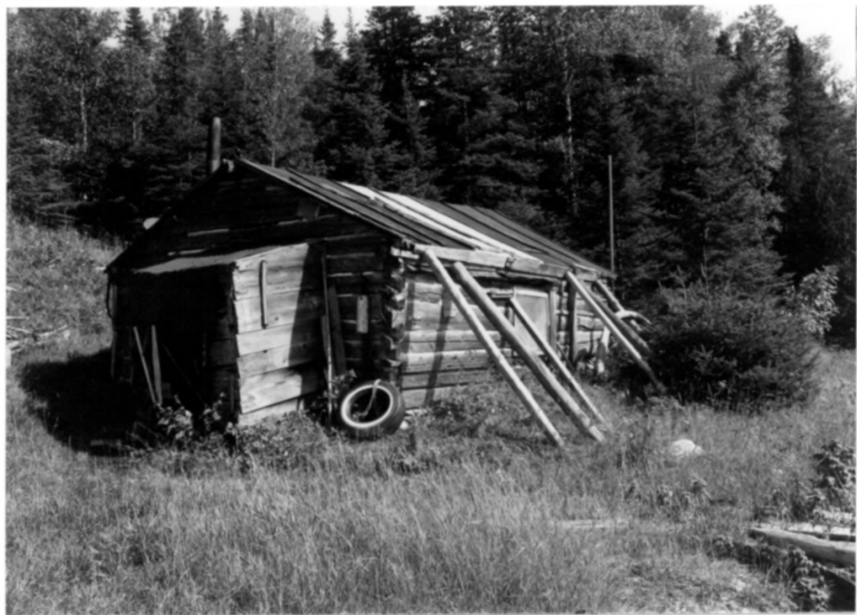
Log Cabin (HS 14-104A) Manitou Camp Manitou Island, WI

Phot. by Apostle Islands NL staff, 1979 Negative located at Apostle Islands headquarters