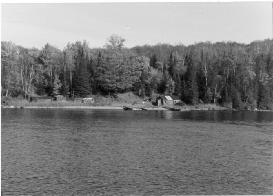
Structures and clearing Manitou Camp Manitou Island, WI