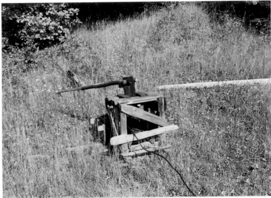
Hand-built Windlass (HS 14-104J) Manitou Camp Manitou Island, WI

Phot. by Apostle Islands NL staff, 1979 Negative located at Apostle Islands headquarters