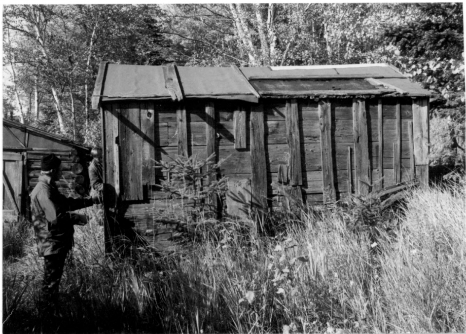
Twine Shed (HS 14-104D) Manitou Camp Manitou Island, WI

Phot. by Apostle Islands NL staff, 1979 Negative located at Apostle Islands headquarters