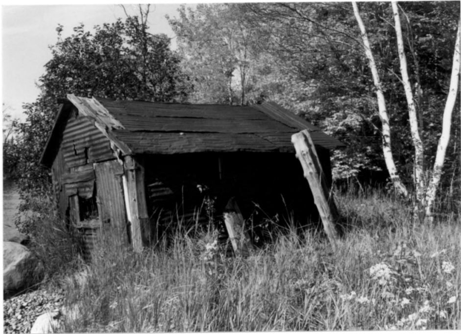
Cabin (HS 14-104E) Manitou Camp Manitou Island, WI

Phot. by Apostle Islands NL staff, 1979 Negative located at Apostle Islands headquarters