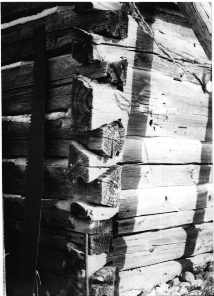
Detail of Log Cabin (HS 14-104A), west corner Manitou Camp Manitou Island, WI