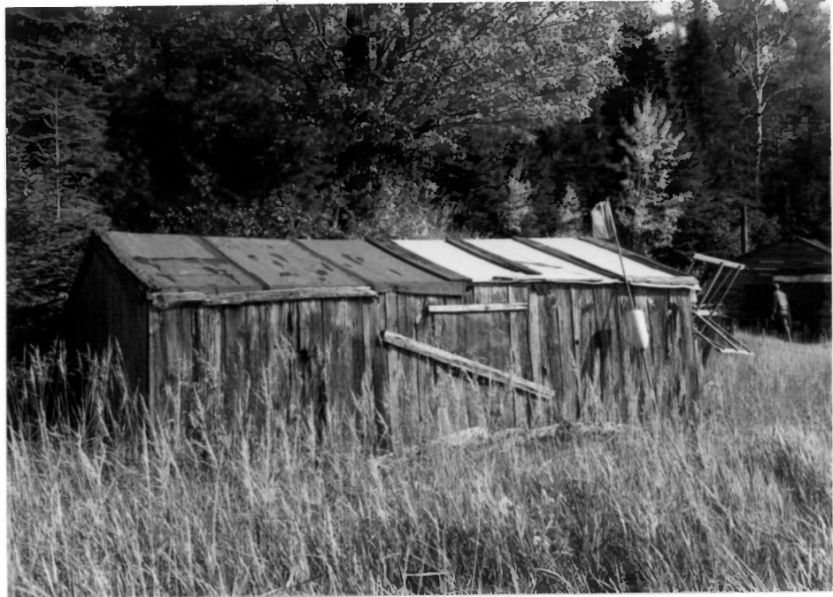
Twine Shed (HS 14-104B) Manitou Camp Manitou Island, WI

Phot. by Apostle Islands NL staff, 1979 Negative located at Apostle Islands headquarters