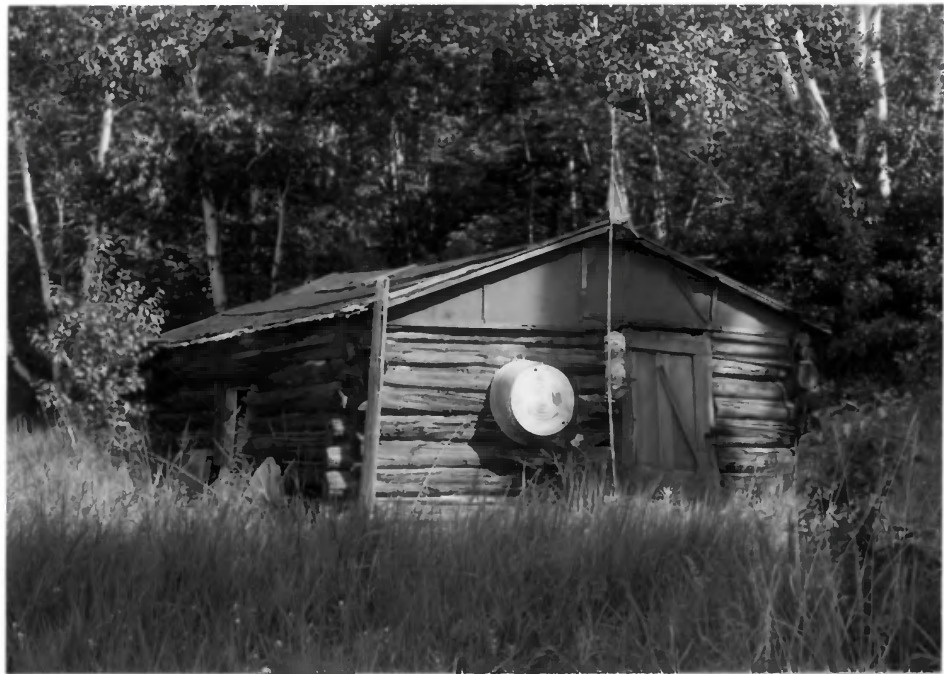
Bunkhouse (HS 14-104C) Manitou Camp Manitou Island, WI

Phot. by Apostle Islands NL staff, 1979 Negative located at Apostle Islands headquarters