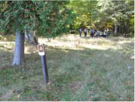
Sand Island group site B is now located in a former cabin site south of the dock at East Bay.

new docks are similar in size to the old models, but have a bin wall (adjoining closed-faced bins composed of corrugated steel members) style cribbing that is anchored to the bedrock replacing the old wooden cribs. The new docks incorporate a flow through design that includes a 40 foot walkway from the shore to the dock. This allows coastal sediment (sand , dirt, gravel) to flow along the shore instead of building up along the dock. The bin wall cribs are filled and have a concrete cap for a deck. The new docks will last longer than the old design. Since waves will not roll through the bins as they did with the old cribs, the new dock will provide more protection for boats tied alongside.