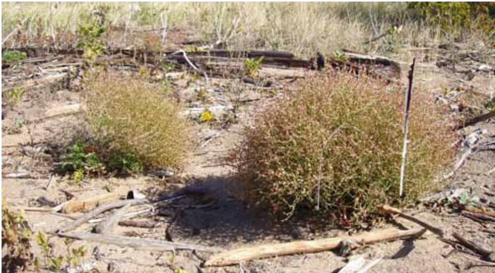
Winged pigweed, a type of tumbleweed, was found growing on Long Island beaches in 2011.

Park staff discovered some strange new species within the boundaries of Apostle Islands National Lakeshore last year. Winged Pigweed, a tumbleweed species normally found west of the Mississippi River, was found on Long Island and Pale Juniper Webworm, a European transport, was found on Michigan Island.