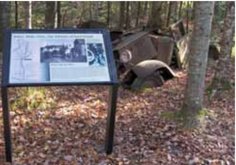
A new wayside exhibit on Sand Island tells the story of two vehicles that were used by island residents.

A new wayside exhibit now warns hikers on the Lakeshore Trail that the cliff edges above the mainland sea caves are unfenced and unstable. Visitors should stay back from the edge. Funds from the Friends of Apostle Islands National Lakeshore paid for the fabrication and installation of the exhibit. An emergency life ring mounted on the exhibit frame is available to be thrown to anyone who might fall into the lake.