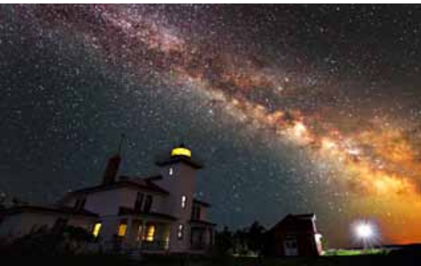
This image of the Milky Way over Raspberry Island is one of the “Lights of the Apostle Islands” images helping to raise money for park projects.