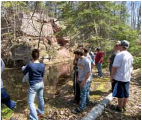
The Loop Trail to the Basswood Island Quarry.