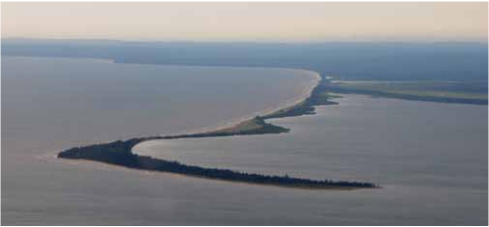
An aerial view of Long Island shows that it is not an island, but a peninsula.

Long Island is also unique in the Apostles, and perhaps in the state of Wisconsin, for providing nesting habitat for the endangered piping plover. Piping plovers are sand-colored shorebirds that arrive on Long Island in late April to early May. They lay four eggs in nests that are shallow scrapes in the sand lined with pebbles and driftwood. The eggs hatch after about 28 days, and the downy young soon follow their parents and pluck insects and spiders from the sand. Last year only 54 breeding pairs of piping plover were found in the