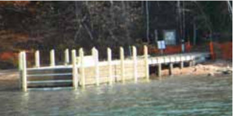
The rebuilt dock at Basswood Island is one of two new docks reopening this summer.

Esiban is the Ojibwe word for raccoon. One story tells how Raccoon was caught stealing from his grandfathers and playing tricks on them. Nanaboujou (a spirit or trickster in Ojibwe legends) catches Raccoon and draws rings around his eyes and tail. Then Nanaboujou tells him from then on, he must search for food at night when it is harder to see and he must wash his food in the water. Lake Superior provides ample water, but also serves as a barrier for raccoons attempting to reach the Apostle Islands. Last spring, however, wildlife cameras captured proof of two raccoons on Sand Island. This is the first known evidence of raccoons on any of the islands in the park (they are found on Madeline Island). Raccoons are good swimmers and can stay in the water for several hours. They are also smart and can open challenging locks in a matter of minutes. Considering these characteristics, campers should always store food and toiletries in the bear lockers and maintain a clean campsite. Please do not feed raccoons, as this may make them even more like Esiban in the Ojibwe story.