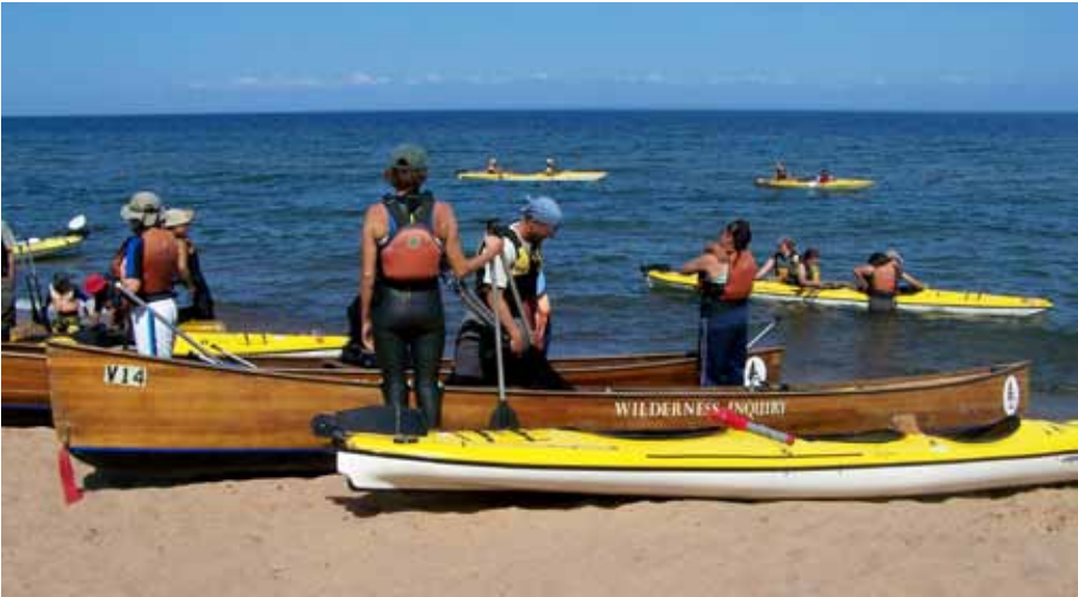
A variety of companies lead commercial trips in the Apostle Islands. A 2004 visitor survey found that the average Apostle Islands visitor invests more in the local economy than do visitors to most national parks.

and contracts with the private sector to accomplish portions of our mission.