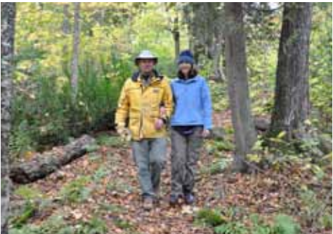
The Julian Bay Trail on Stockton Island.