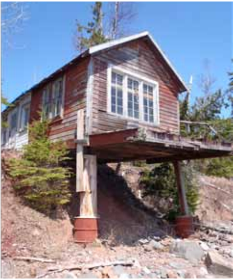
The “Boar’s Nest” at the Hansen Farm on Sand Island will be moved back from the edge of the lake this summer.