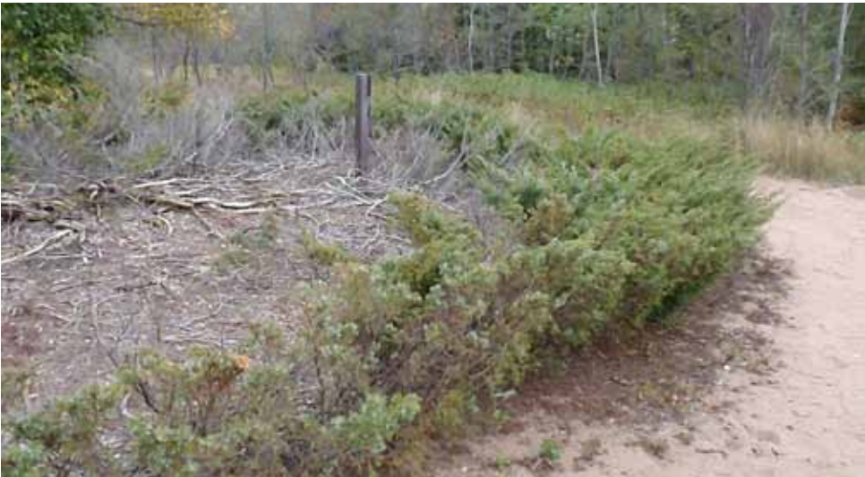
The center of this juniper shrub has been decimated by pale juniper webworms.

Pale juniper webworms are easily recognizable because of the damage they cause. Webworms feed on the needles of juniper shrubs, leaving them brown and dying. The central branches of the shrub acquire a skeletal look as the leaves die and fall off. Webworm larvae