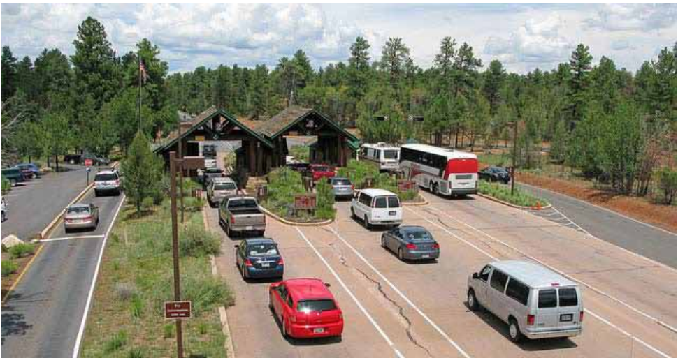
Visitors line up to enter Grand Canyon National Park. In 2010, 281 million visitors to national park units around the country spent over $12 billion in the parks and their nearby communities.

National parks also affect the economy through the spending the NPS itself does, through payroll, purchases of supplies and equipment, capital investment,