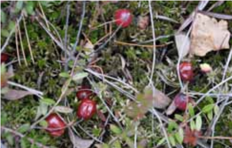
Edibles like these cranberries may be collected in limited quantities.

The Real-time Wave Observation System (RTWOS) at the Mainland Sea Caves will continue to provide wave heights and wave pictures this season via the internet at: http://wavesatseacaves.cee.wisc.edu/index.htm . Please check this site for the latest conditions at the Mainland sea caves. Rangers stationed at Meyers Beach this summer will have access to weather and wave condition information. The National Park Service and its partners are exploring ways to provide a digital display at Meyers Beach so visitors will be able to check conditions before they paddle to the caves.