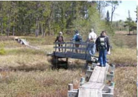
The Tombolo Trail on Stockton Island.