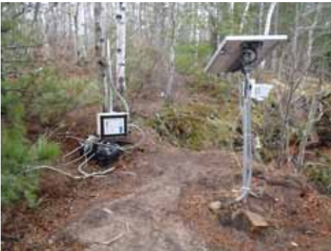
Real-time wave data and water tmperatures are transmitted using wireless cellular technology to a host computer at UW-Madison.

Some mountain parks have skilled ranger teams who conduct high-angle rescues of injured visitors. But not too many parks are faced with conducting a high-angle rescue on a historic building. That’s exactly the problem facing Apostle Islands staff at Sand Island where two commercial fishing buildings at the historic Hansen Farm are being gradually undercut by Lake Superior waves. Decades of erosion have left one building hanging approximately ten feet over the bank, and threatening to fall into the lake. Undercutting is just beginning at the second building. Prompt action is needed to save the structures. In 2012, with the assistance of coastal restoration funds from the Great Lakes Restoration Initiative, both buildings will be moved back from the lake where they can be safely preserved. This spring, an Ashland construction company will begin carefully shoring and bracing the buildings, and then rolling them back along rails to their new resting place. Preservation work on these and other farm structures will take several more years before the site can be safely opened to the public. The re-located structures will be used to help tell the story of commercial fishing and island life at the Hansen Farm.