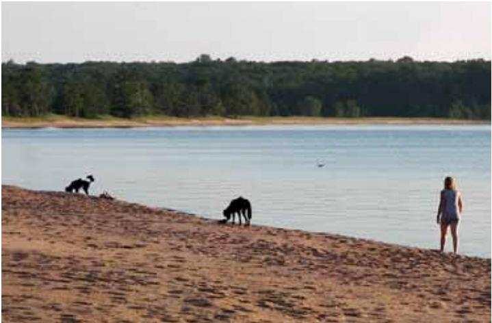
Unleashed dogs threaten plovers and other wildlife. Dogs must be kept on a leash that is no longer than six feet.