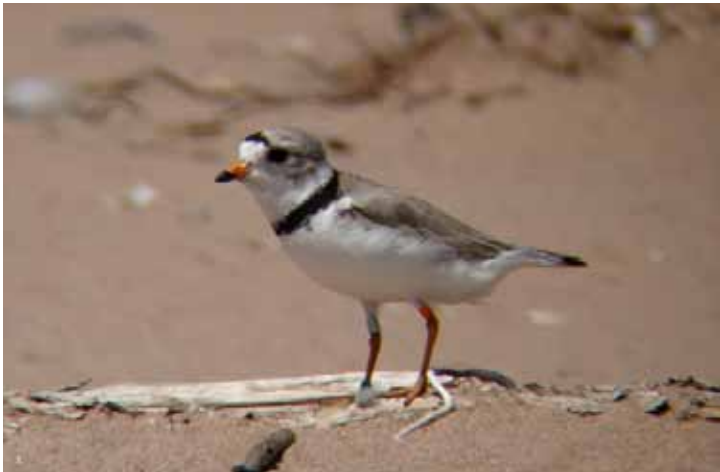
Long Island is the only place in the state where endangered piping plovers nest.

Long Island is part of Apostle Islands National Lakeshore. Island visitors are subject to the same National Park Service (NPS) rules and regulations that apply in the rest of the national lakeshore. Dogs are required to be on a leash six feet or shorter at all times. Unleashed dogs pose a great threat to piping plover nesting success and chick survival. Last year, NPS law enforcement rangers made a concerted effort to educate visitors and decrease offenses, especially the number of dogs off leash. Numerous warnings were issued to visitors. Citations will be used more frequently this year. Enjoy your visit to Long Island, but help us protect the spectacular wildlife that only nests on this narrow strip of sand.