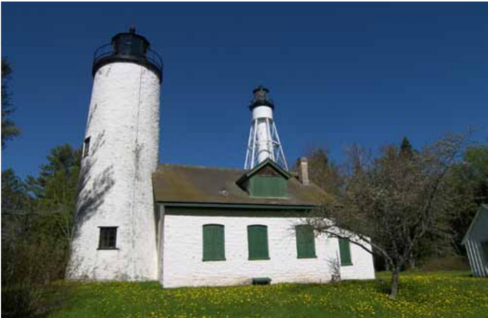
Work at the Michigan Island Light Station will include four buildings and clearing four acres at the site to restore the cultural landscape.

After a busy winter of construction design, the Apostle Islands’ lighthouse preservation project is almost ready to hit the field! Beginning in spring 2012, the multi-million dollar preservation project goes out for bid, and a general contractor will be selected to start work this summer. The project will provide for urgently needed repairs at five of the park’s light stations, requiring the efforts of many trades and specialists including architects, masons, painters, carpenters, roofers, structural engineers, electricians, and lighthouse preservation specialists.