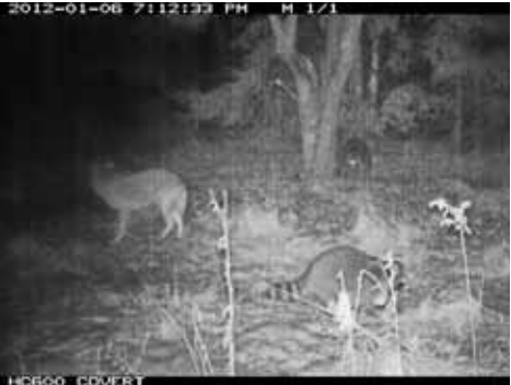
Two raccoons and a coyote were photographed by a wildlife camera on Sand Island in January.

New guidelines have been established governing the collection of edible plants in Apostle Islands National Lakeshore. Native fruits (except apples), nuts, and berries not from plants listed as threatened or endangered species may be collected in quantities up to one gallon per person per week. Up to five gallons of apples per person per week may be harvested in the park. All edible mushrooms not listed as threatened or endangered species may be collected in quantities up to one gallon per person per week. The gathering of fruits, nuts, berries, apples and mushrooms by hand in the quantities identified will not have an adverse affect on the various plant species. Wildflowers may NOT be collected in the park.