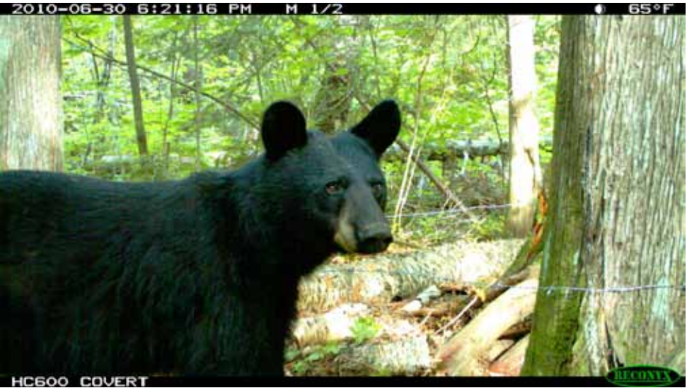
Black bear inspecting one of the bear-hair-snares set on the islands in 2010.

In contrast to Stockton Island, the bear population on Sand nearly doubled between 2002 and 2010 (from 6 to 10 bears) and the population of 18 bears on Oak Island is exceptionally high. For many years Stockton was thought to have the highest population