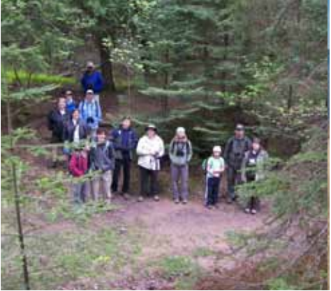
Hiking the Lakeshore Trail on the mainland.