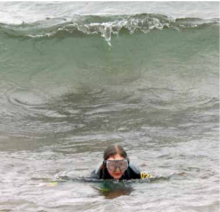
Top: Reflective material on PFDs improves their visibility, especially at night. Middle: Paddlers have about 10 minutes to attempt self-rescue before losing control of arms and legs and not being able to swim. Bottom: Even in the middle of summer, Lake Superior surface water rarely gets above 60 degrees F. In these temperatures the human body cannot generate enough heat to keep warm.

So, the changing climate does seem to be having an impact on one of the world’s largest lakes. Lake Superior’s surface temperatures are rising. By all means, enjoy the relatively warm water near beaches in shallow bays where you can quickly go to shore if you start to get chilled. But be aware that even during the dog days of summer, Lake Superior water is still cold and unforgiving if you are immersed too long and can’t get out.