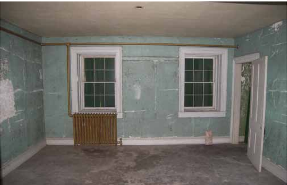
The floors, doors, trim and plaster inside the Old Michigan Island Lighthouse will be rehabilitated and new interpretive exhibits are being planned for rooms on the first floor.