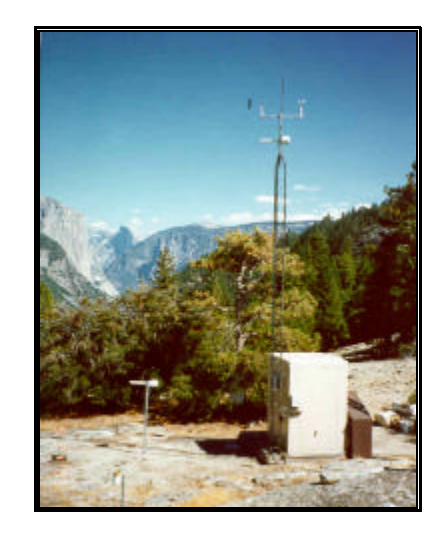
"Lv Rbyoybny Xbc Rbvlyfl"

A cryptogram is a coded message in which one letter is substituted for another. Example: Etgpyikybp = Multipoint.