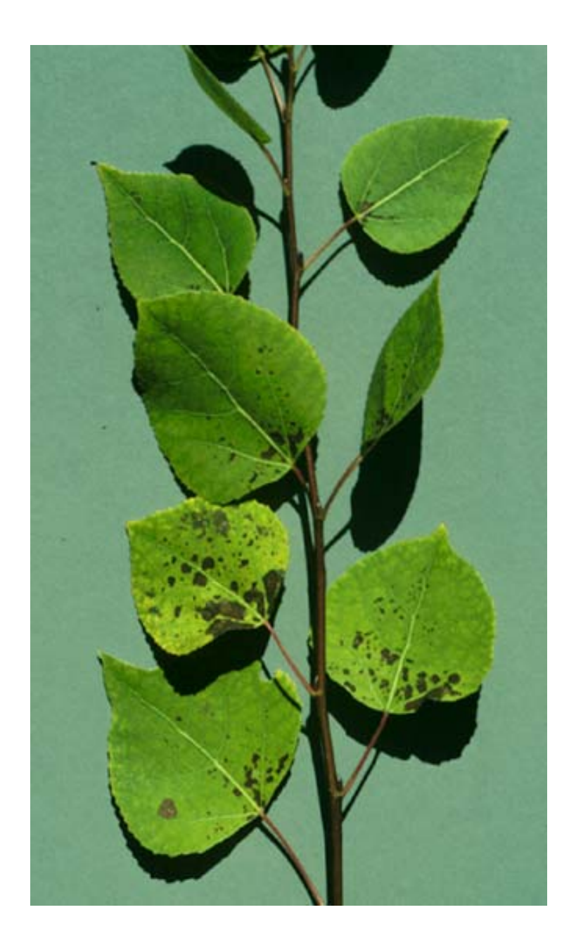
Figure 5. Bifacial necrosis on aspen ( Populus tremuloides ) with the greatest injury on older leaves that were exposed to ozone for the longest period of time.

The use of foliar markings as diagnostic tools is more demanding with conifers than with other species. Tipburn and mottle on needles can be induced by a variety of stresses and their value in diagnosis is highly dependent on the ability of the observer to make subtle discriminations and judgments. In general, assessment of foliar ozone injury on conifers requires more training and experience than does assessing injury on herbaceous and broadleaf tree species. While conifers have been used in many field surveys, the probability of misdiagnosing markings on their needles is likely greater than for other