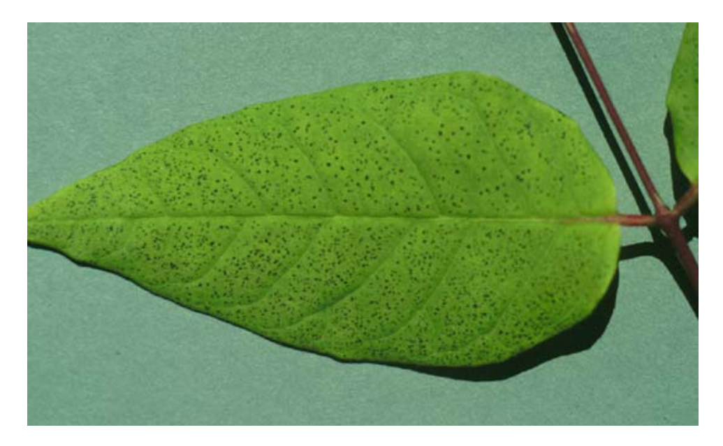
Figure 1. Widely-scattered stipple on spreading dogbane (Apocynum androsaemifolium).

Foliar ozone injury on broadleaf plants is generally categorized in increasing levels of severity as stipple, chlorosis, fleck, and bifacial necrosis. Stipple is characterized by the appearance of interveinal, dot-like areas of tan, red, brown, purple, or black pigmentation on the upper surface of the leaf. Stipple can be either uniformly distributed over the surface of the leaf or concentrated in certain areas. It may range from widely scattered dots to dots whose density nearly covers the surface of the leaf. Coloration, density, and distribution are functions of plant species and the duration and nature of exposure. The production of stipple requires exposure of the leaf surface to direct sunlight. A closely overlapping leaf can protect the lower leaf by covering it and producing a "shadow" in the injury on the leaf surface.