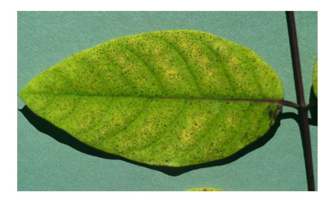
Figure 4. Spreading dogbane ( Apocynum androsaemifolium ) leaflet showing cooccurrence of chlorosis, stipple and developing fleck.

Foliar markings can serve as important tools in diagnosing ozone injury on broadleaf species of plants. Stipple is a classic symptom associated with injury by ozone and its presence and coloration are diagnostic for the pollutant. The pattern of expression of injury on individual leaves and on a series of leaves provides strong complementary information for diagnosis. The presence of stipple, fleck and bifacial necrosis and their patterns of expression are strong diagnostic tools. Chlorosis is the least valuable aid to diagnosis due to its generalized appearance and ability to be induced by a range of stresses.