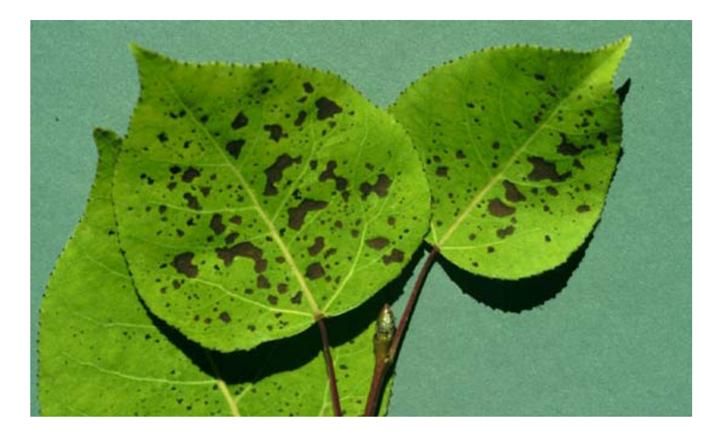
Fig 3. Bifacial necrosis on aspen (Populus tremuloides).

Ozone injury on needles of conifers generally appears as either tipburn or chlorotic mottle. Tipburn is considered to be primarily induced by acute exposures and mottle by chronic exposures, although variations exist in these responses. Tipburn consists of tissue that has been killed either through dieback of the needle's tip or has died following the development of a band of dead tissue along the needle. The dead tissue may become red to brown. Mottle consists of discrete patches of yellow tissue and can be further classified as hard- or soft-edged. Ozone-injured needles may be shed prematurely, leaving the tree with less than its normal complement of needles.