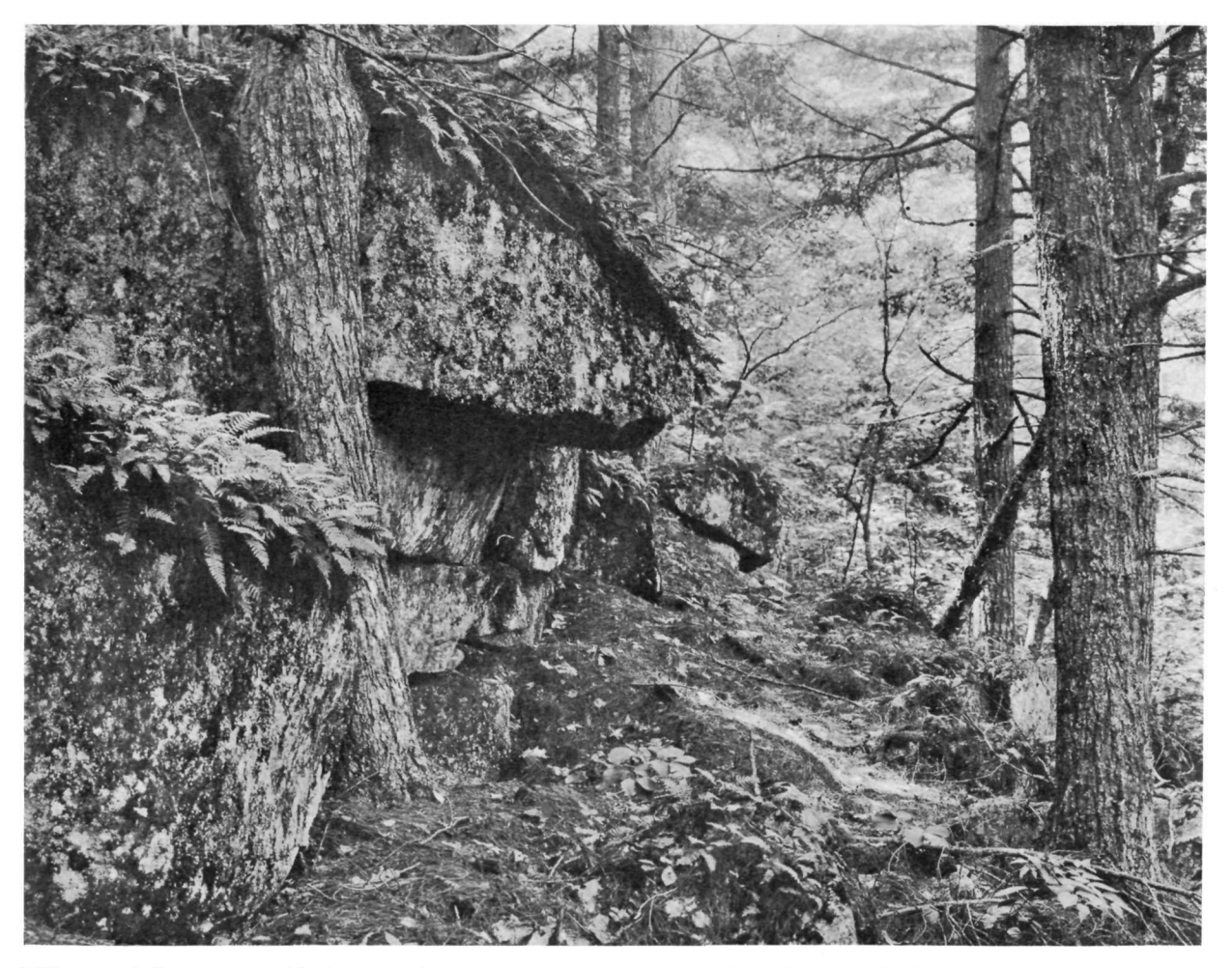
The wooded mountain side between Sieur de Monts Crag and Spring, whose hemlock-shaded rocks are crowned with fern