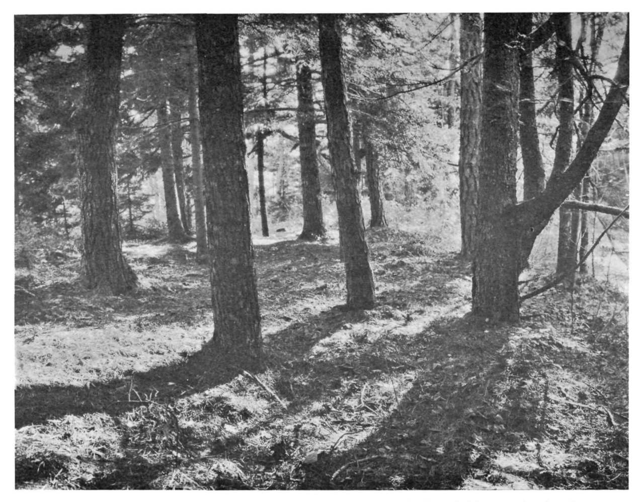
A high mountain valley, wooded with hemlock, spruce, and pine, in Sieur de Monts national park