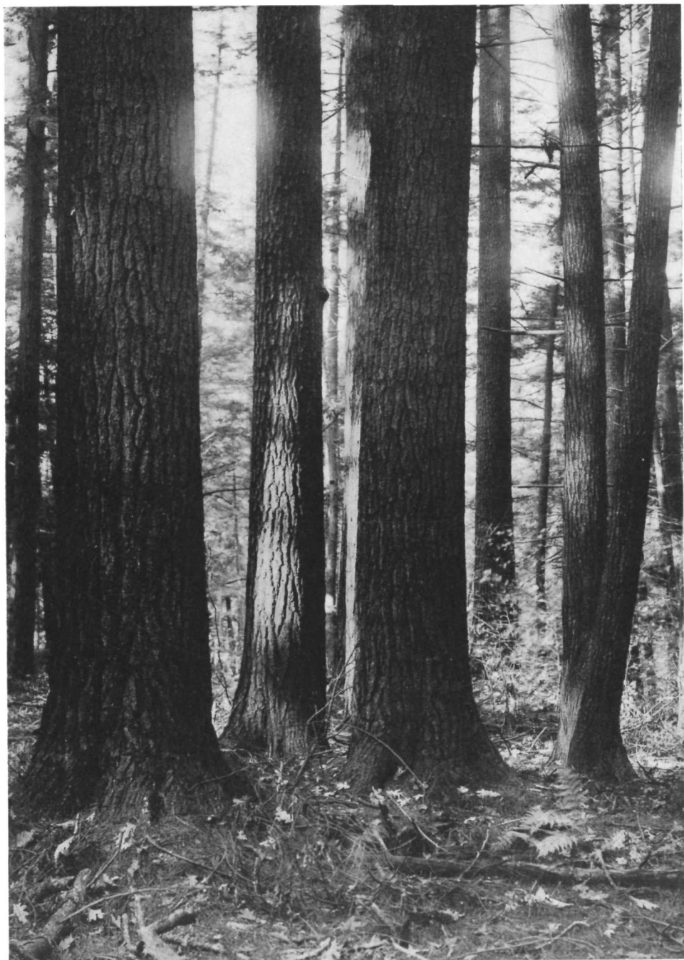
Giant Pine-trees in the north