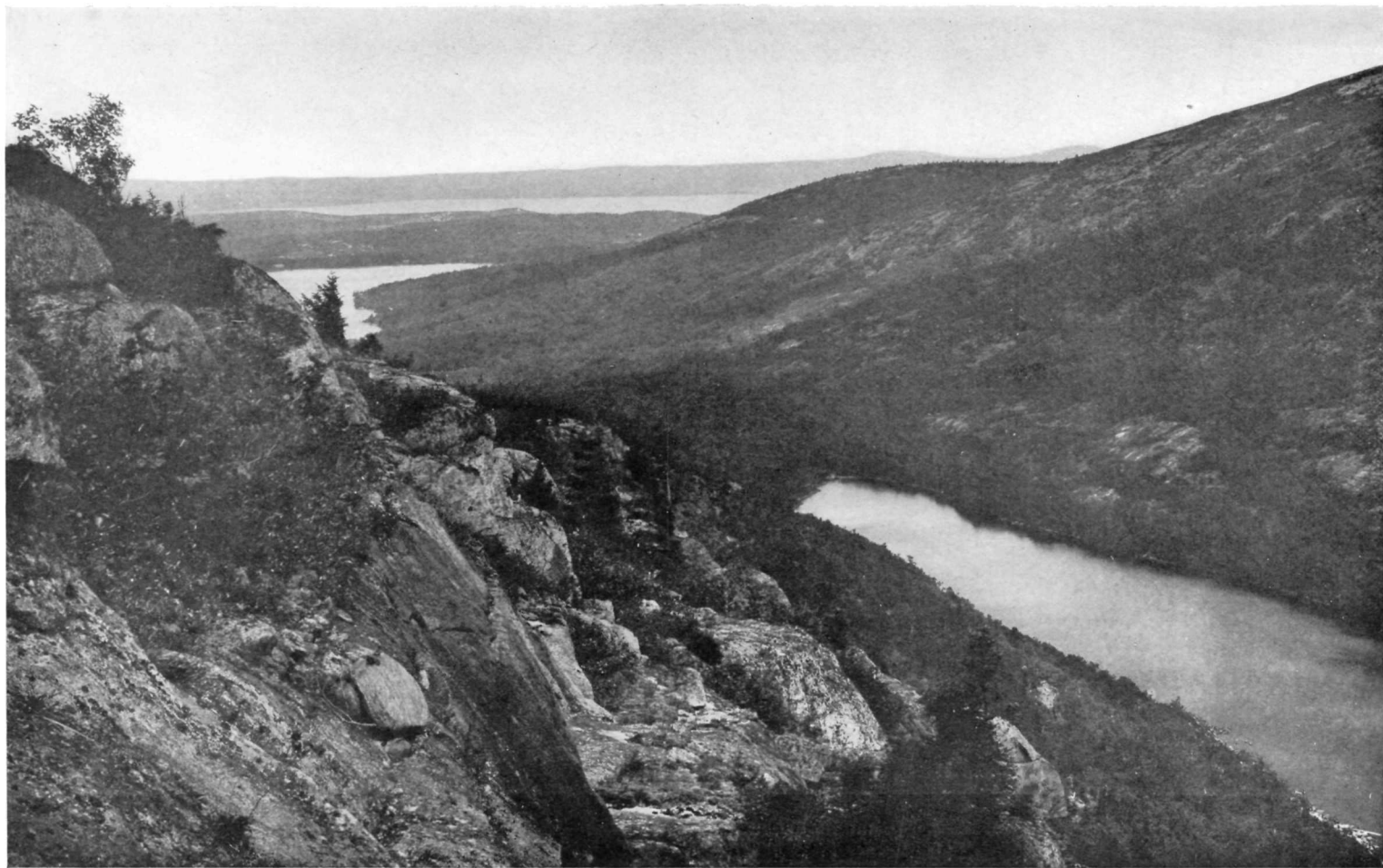
Lakes in the Sieur de Monts national park—Looking north toward the Mainland