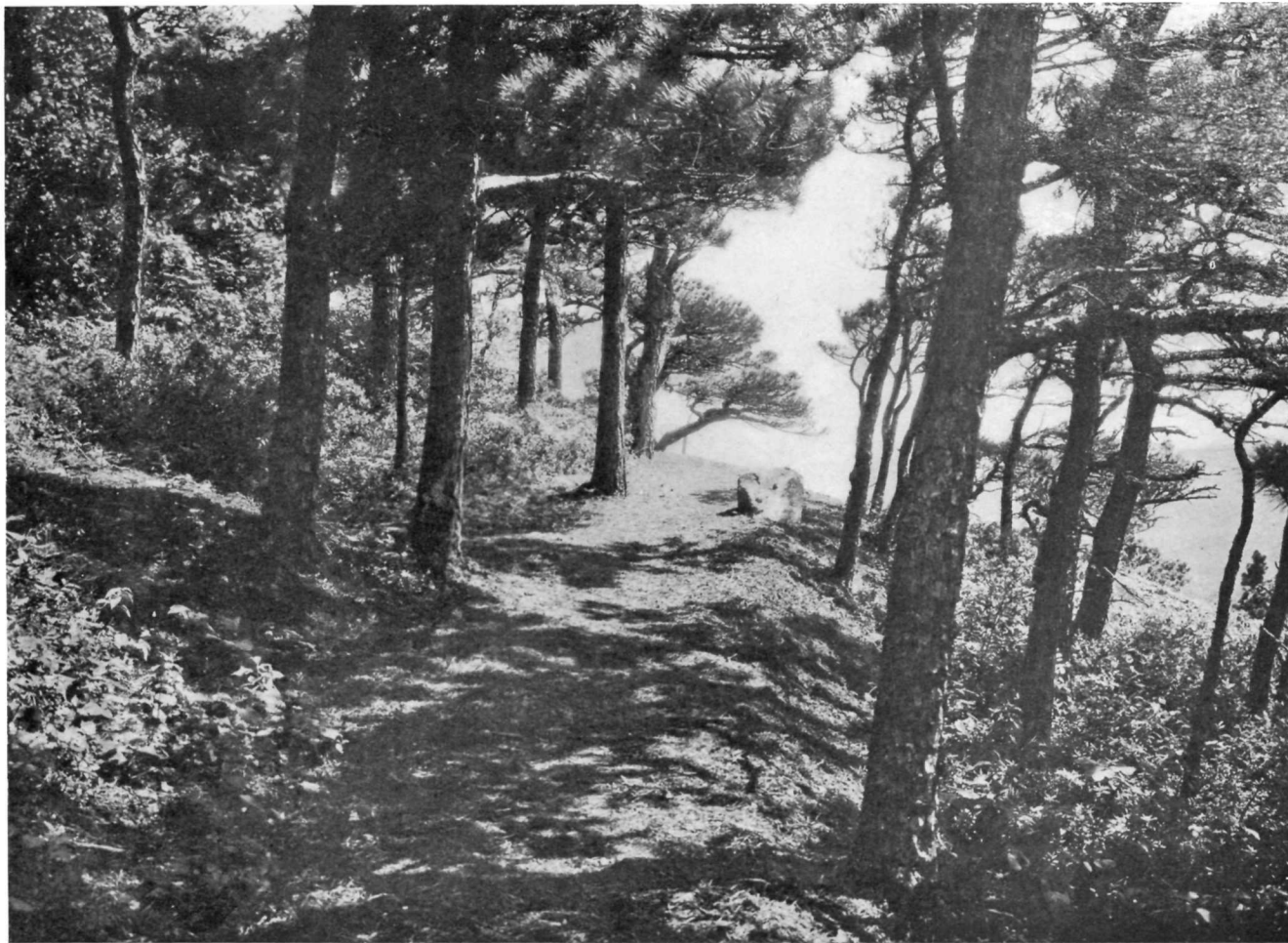
The path to Huguenot Head and a great ocean view; Sieur de Monts national park