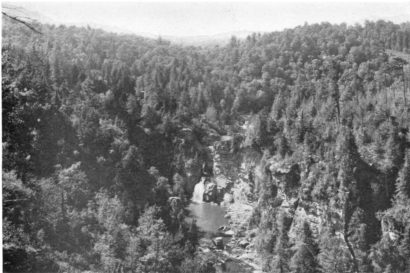
Water lending beauty and refreshment to a Southern Woodland