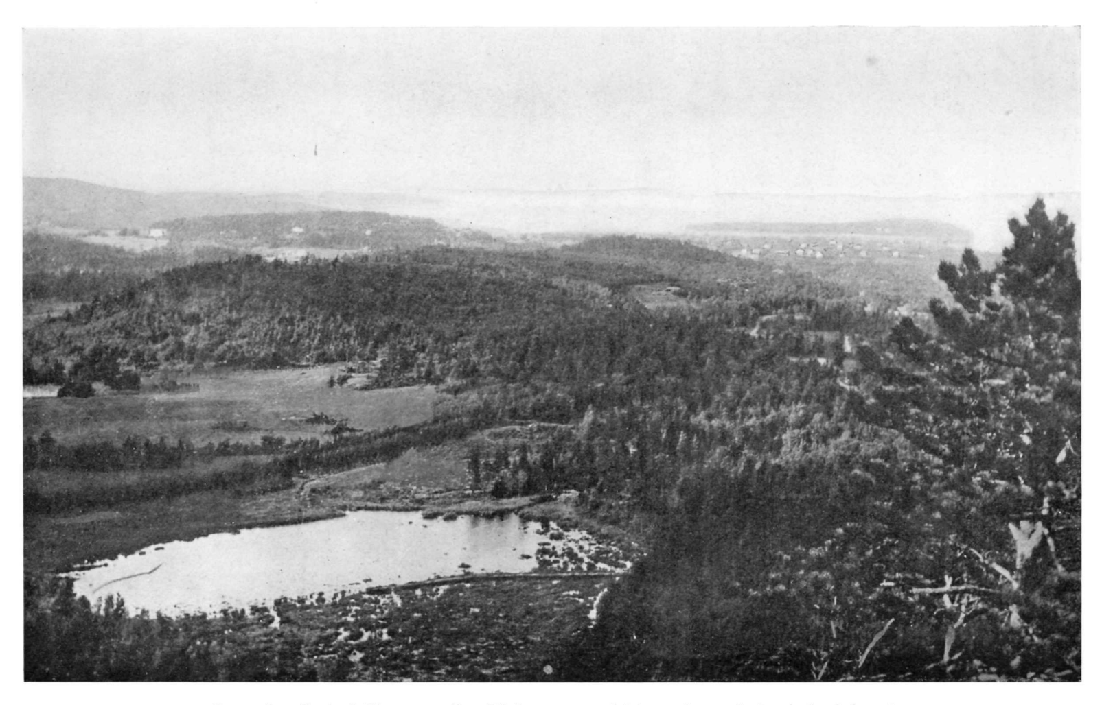
Beaverdam Pool: A Plant as well as Bird sanctuary, fed by springs and singularly sheltered