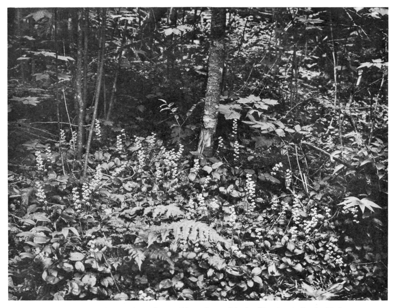
Wild flowers in national park woods upon Mount Desert Island. The plant is Pyrola elliptica