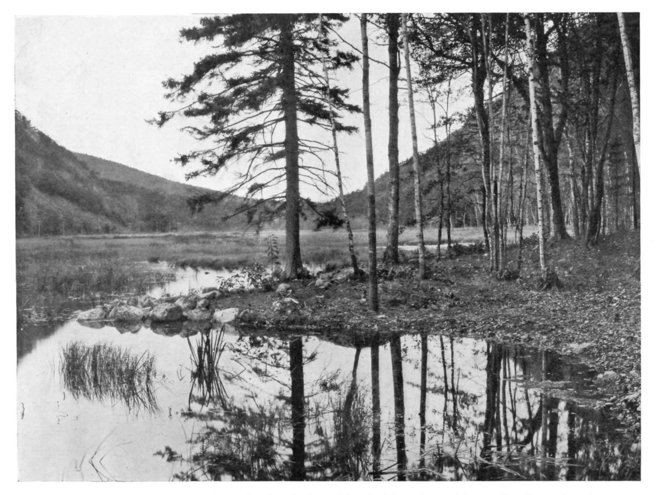
A delightful water garden in the national park, formed by glacial erosion and later soil and peat deposit