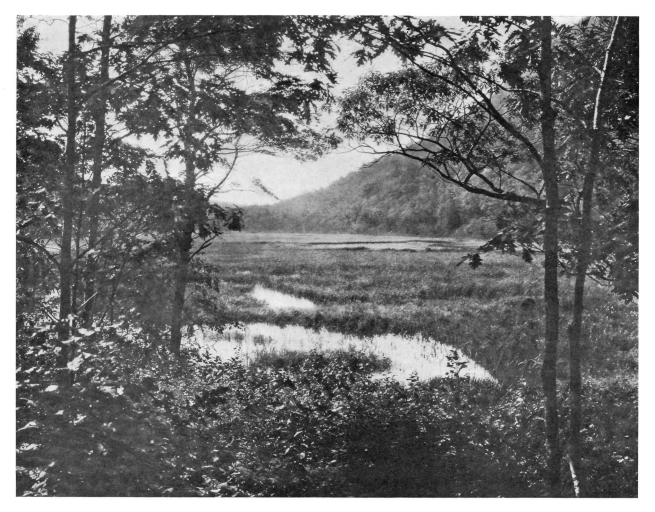
The Gorge that makes a natural highway for birds and men between the Island's Northern and Southern Shores