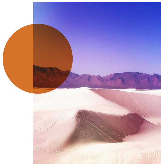
White Sands National Monument (courtesy of @danielgross).