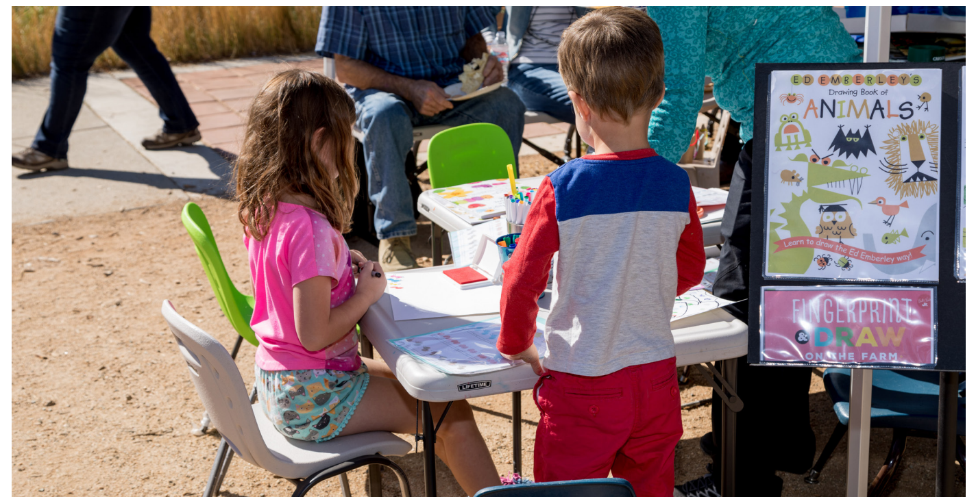
There were many activities for children at Birdfest.