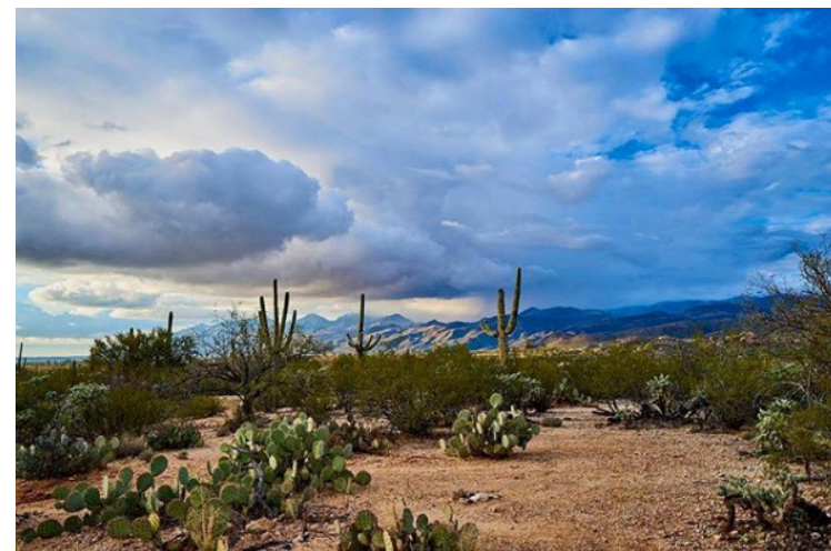
Saguaro National Park.