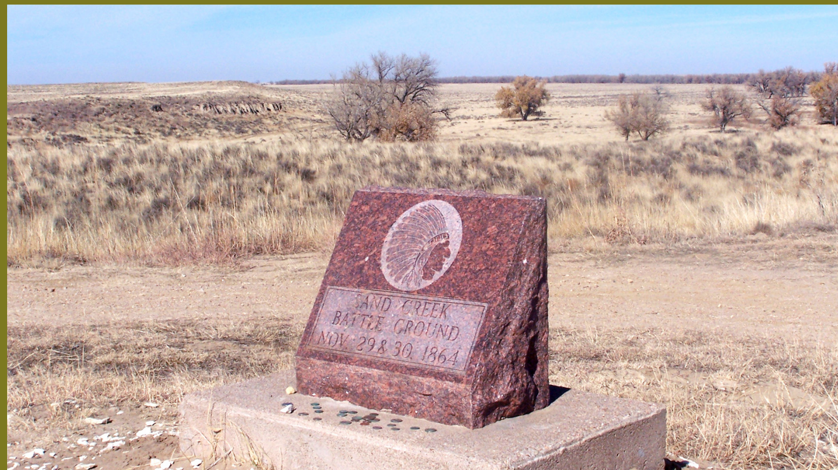
Hundreds of Cheyenne and Arapaho were killed in the Sand Creek Massacre.