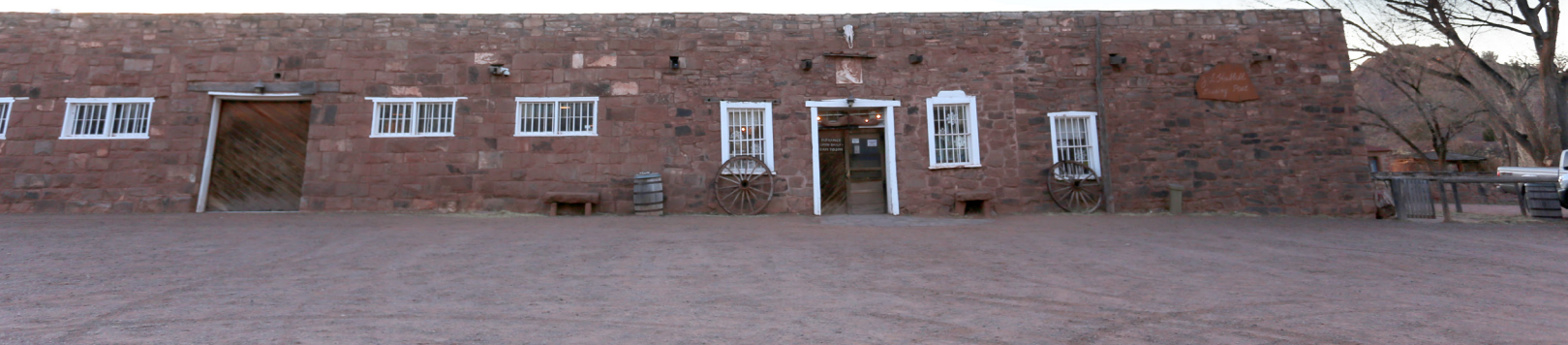
Hubbell Trading Post is located on the Navajo Nation.

“Hubbell Trading Post is the oldest continuously operating trading post in the American Southwest.”