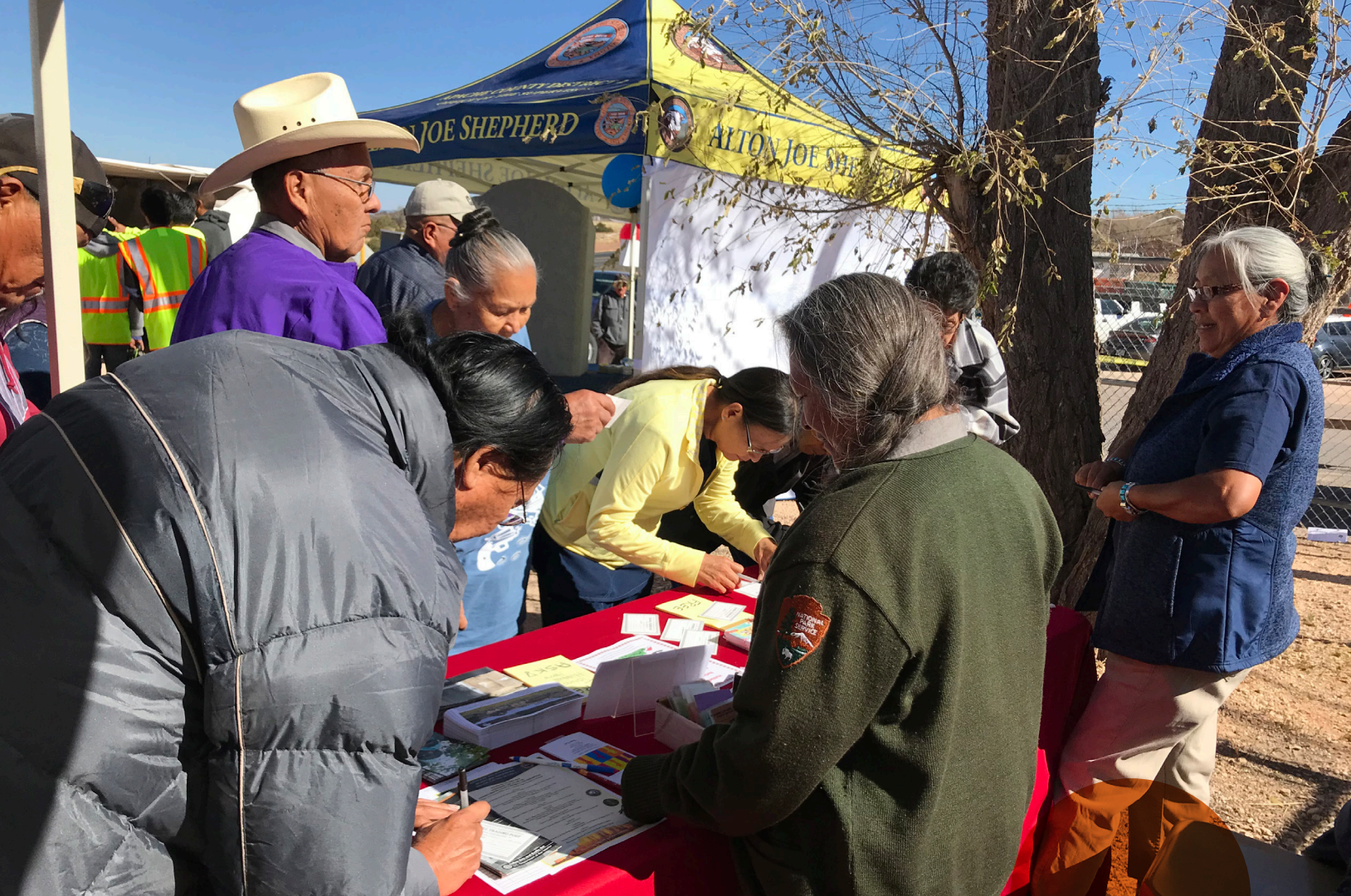
WNPA and NPS staff from Hubbell Trading Post at the outreach table.