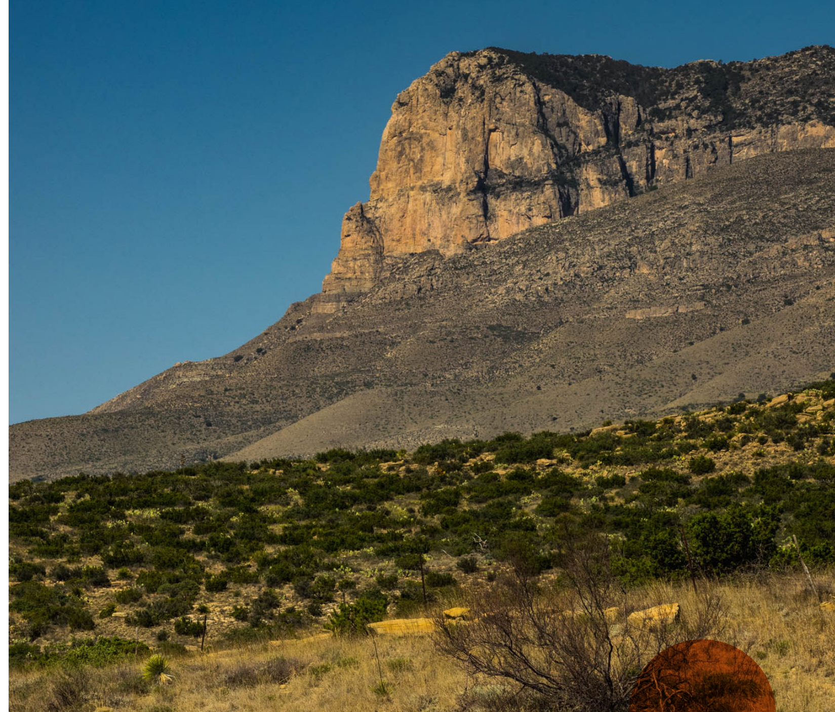
El Capitan, Guadalupe Mountains National Park.