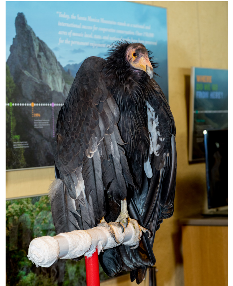
Dolly the California condor was a big hit!

Birdfest is the event of the year for Santa Monica Mountains National Recreation Area , and this year didn't disappoint! Dolly the California condor was there from the Los Angeles Zoo & Botanical Gardens, and 1,287 visitors greatly enjoyed all the bird activities of the day. Representatives from several Audubon societies, including Conejo Valley Audubon Society and Pasadena Audubon Society, attended to provide information and fun activities. One station was set up to create peanut butter and birdseed bird feeders, while others had coloring pages, owl pellet dissection, and a spin-the-wheel raffle. Nature of Wildworks held a demonstration with several live birds for a packed audience. There were also bird-themed items available for sale, including paintings, books, tote bags, hats, and binoculars for birding. It was a fun day for all, and a great way to celebrate birds.