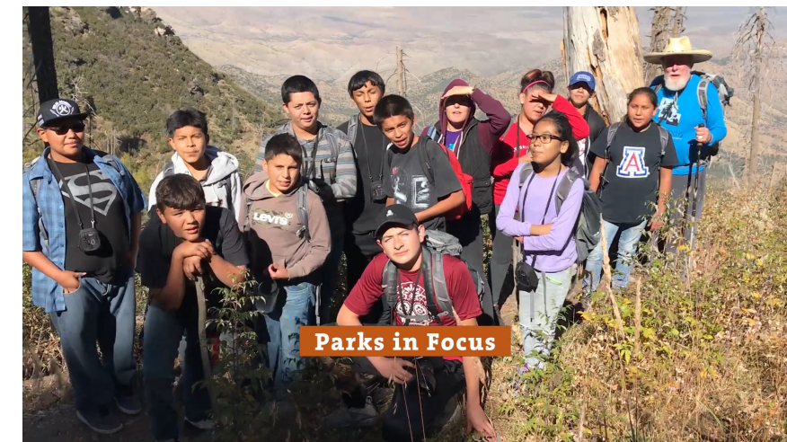
Participants in the Stewart L. Udall Parks in Focus program.