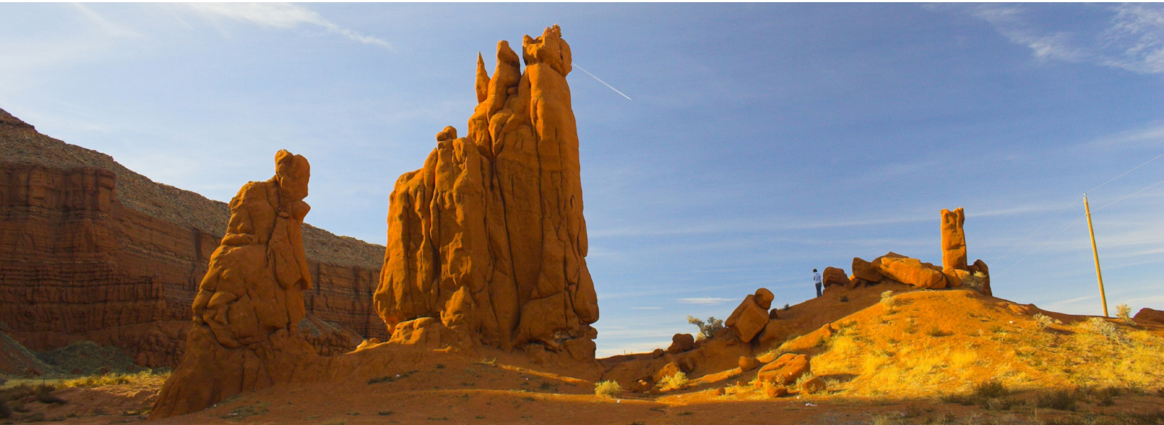
Canyon de Chelly.