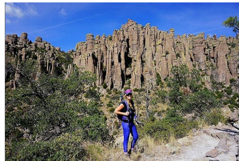
Chiricahua National Monument.