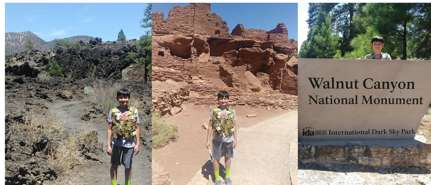
Wupatki National Monument, Walnut Canyon National Monument, and Sunset Crater National Monument | @junior_ranger_bry