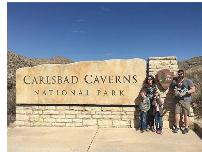
Carlsbad Caverns National Park