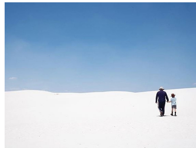
White Sands National Monument | @parkventurous