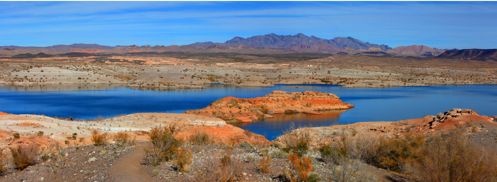
Lake Mead National Recreation Area.