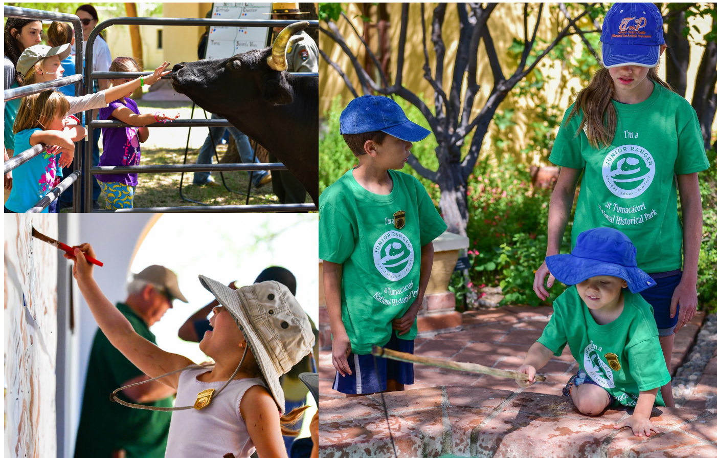
More than one hundred children became Junior Rangers at Tumacácori National Historical Park.