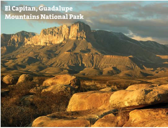
El Capitan, Guadalupe Mountains National Park