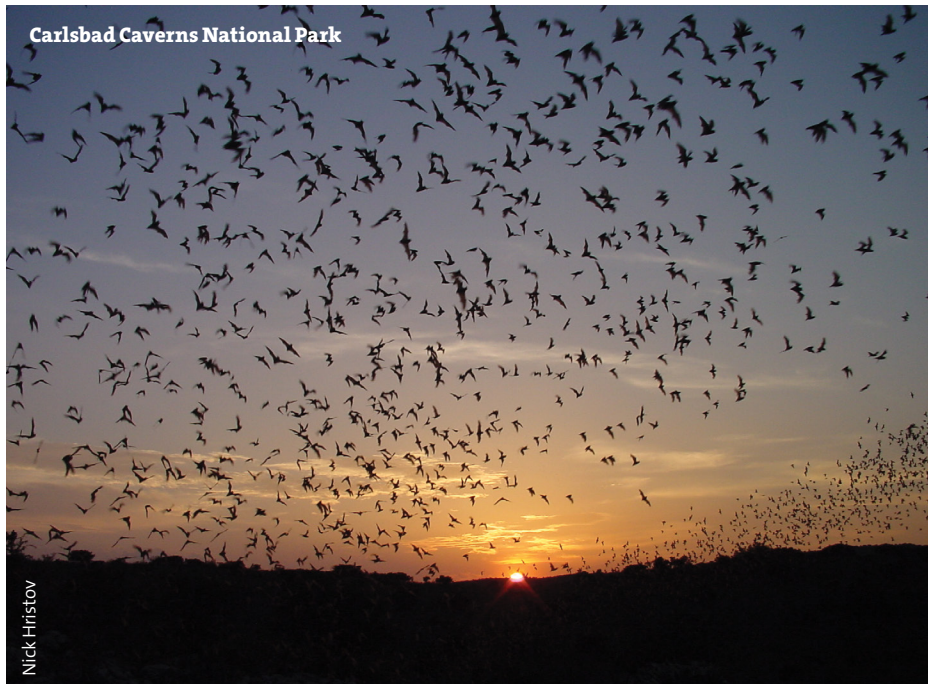
Carlsbad Caverns National Park

Remember: you can always stand with a saguaro! Be sure to post a photo on social media with the hashtag #istandwithsaguaros.