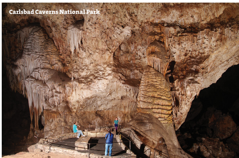
Carlsbad Caverns National Park