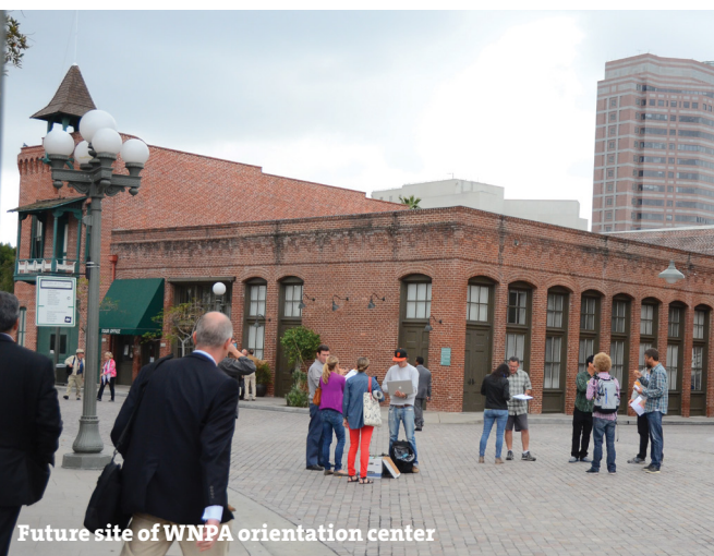
Future site of WNPA orientation center

Join us for the ribbon cutting at our new facility in Los Angeles, and also to celebrate LA’s 235th birthday on Saturday, August 27, from 10 AM to 2 PM at El Pueblo de Los Ángeles Historical Monument, 130 Paseo de La Plaza, Los Angeles, CA 90012.